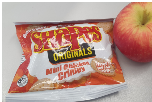
Chicken Crimpy - Falls into Red

Sausage Roll Pastry Puff and short-crust pastry.