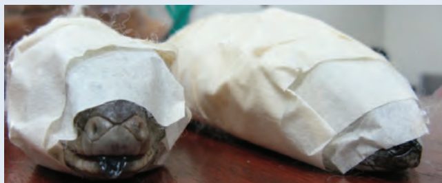
Blue tongued lizards found in a teddy bear were taped from head to tail.

Other examples relate to the illegal export of native reptiles from Australia. This is a particularly cruel and lucrative trade as illustrated by the following examples.