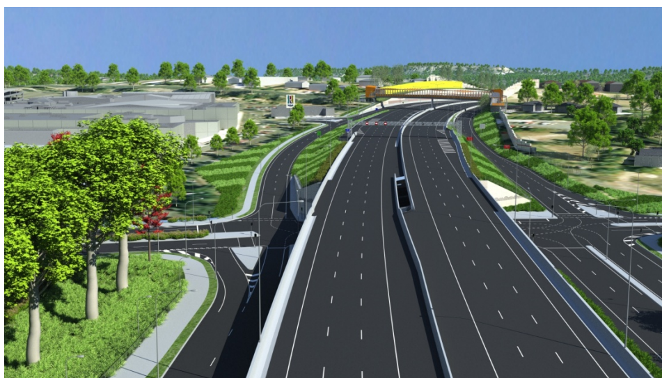
3ds Max Design visualization model.