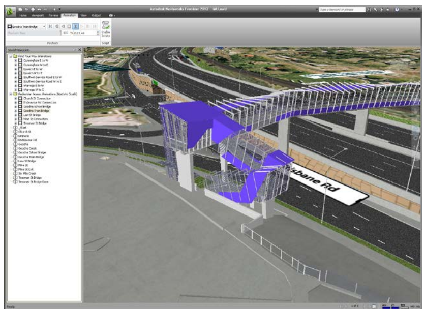
Figure 3: Navisworks 3D model.