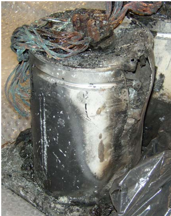
Fig. 4: Burst pressure vessel of a line filter capacitor

Several areas of damage were caused by parallel resonant circuits existing of capacitors (reactive power compensation or line filters) and inductances (generator, turbine transformer, energy supply companies, power chokes, etc.) which had not been taken into account when designing the turbine. The resonant circuits were activated by harmonics. Resonance phenomena generated high currents which damaged capacitors. Breakdowns in the dielectric of the already damaged capacitors – usually caused by overvoltage events – resulted in an increase of power loss and in some cases in the bursting of the capacitor containers. The resulting fires caused total loss to the reactive power compensation or to the inverter. Protective circuits through discharge resistors and choking were not available in these cases.