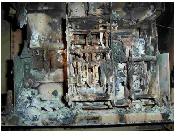
Fig. 3: Power switch of a 1 MW wind turbine – destroyed by fire

Low voltage switchgear was installed within the nacelle of a 1 MW wind turbine. The bolted connection at one of the input contacts of the low-voltage power switch was not sufficiently tightened. The high contact resistance resulted in a significant temperature increase at the junction and in the ignition of adjacent combustible material in the switchgear cabinet. The fuses situated in front did not respond until the thermal damage by the fire was very severe. Control, inverter and switchgear cabinets that were arranged next to each other suffered a total loss. The interior of the nacelle was full of soot. Despite the enormous heat in the area of the seat of fire, the fire was unable to spread across the metal nacelle casing. The damage to property amounted to EUR 500,000.