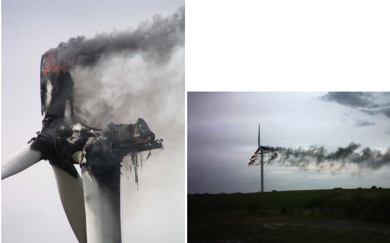
Fig. 1a+b: Fire after lightning struck a 2 MW wind turbine in 2004

The burning blade stopped at an upright position and burned off completely little by little. Burning parts of the blades that fell down caused a secondary fire in the nacelle.