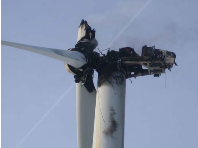
Fig. 2: Burnt down nacelle of a 1.5 MW wind turbine