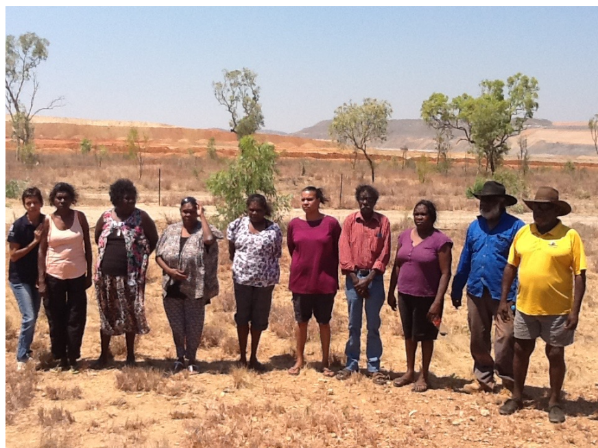
Figure 1: NAK Board visiting Borrooloola, NT (Sept, 2015)

approved a Mineral Development Licence application from Glencore to mine RA315, however this company is swamped by negative press, Government reviews and traditional owner protests. No MDL should be granted to Glencore. For how can this company be allowed to open yet another mine in Australia whilst their current mines are surrounded with such controversy? I specifically refer to our brothers and sisters in and around Borrooloola, Northern Territory. We might share similar dreamtime stories with them, but we certainly don't want to share the devastation they've experienced from Glencore. Contaminating waterways, neglecting to notify the local clans, and failing to deal with environmental catastrophes is not a company you want near the Aurukun wetlands. The Wik lands that surround RA315 need to be respected and protected.