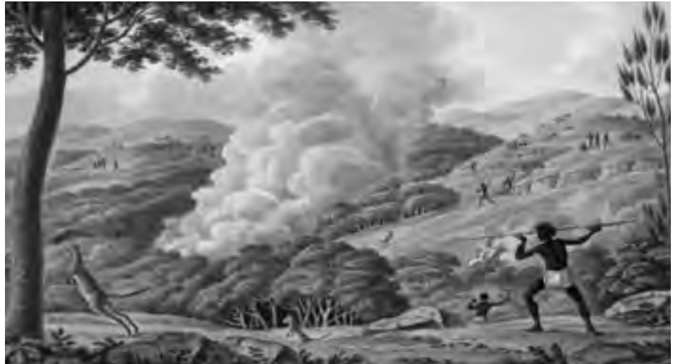
In the traditional Aboriginal landscape, burning occurred on a regular patchwork basis for hunting game and to keep the country clear as they moved through it.

In the Northern Territory, fire was applied in different ways. At times it was applied to specific areas under mild conditions to ensure that only small patches were burnt. At other times, it was applied under more severe weather conditions and burning would continue for several days. In the south-west jarrah forests