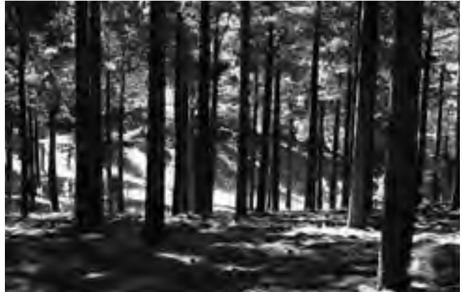
23 year old radiata pine plantation pruned to 8m. Surface fuel is easy to reduce by burning.

Good fuel management early in the life of plantations of smooth-barked eucalypts, such as blue gum, can make them virtually fire proof for up to eight years after establishment until litter starts to accumulate beneath the trees.