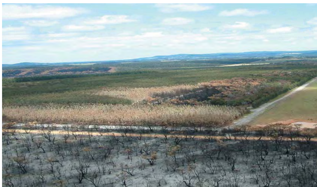
Figure 1: Blue gum plantations stop a bushfire from spreading near Albany, Western Australia.

Another example occurred in November 2002 where a large fire burnt 20,000ha of native forest near Albany in Western Australia. The fires were slowed down by two 4 year old blue gum plantations managed by a private forestry company. Despite many burning embers landing within the plantations, the fire did not spread to any significant extent. One of the plantations aged 3.5 years had 0.1ha defoliated adjacent to crowning native vegetation and around 3ha of scorch as a result of radiant heat from intensely burning native vegetation, with no fire entering the plantation itself. The other, aged 4.5 years suffered scorch of around 0.5ha, again adjacent to native vegetation, with around 3ha carrying fire within the plantation, with minimal associated scorch.