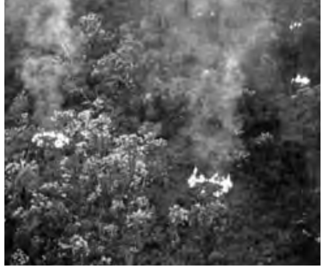
Prescribed burn in the Grampians.