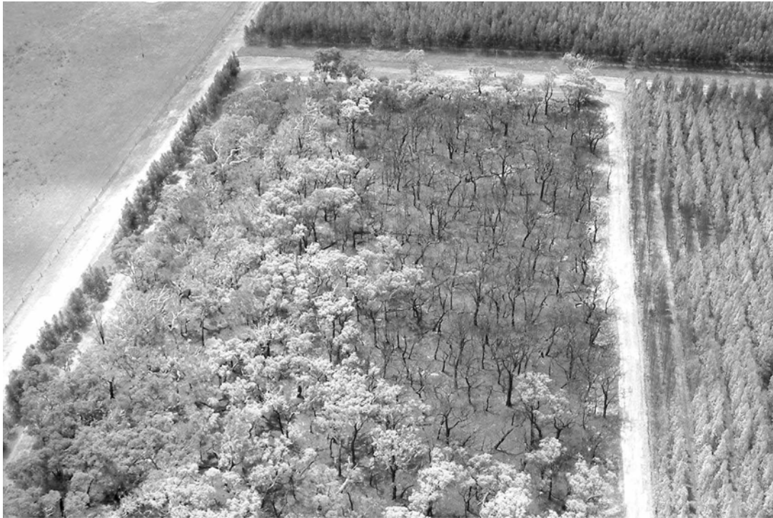
Figure 2: An aerial view of the November 2002 fires in Albany, where a large fire burning under extreme weather conditions, slowed down when it hit two blue gum plantations.