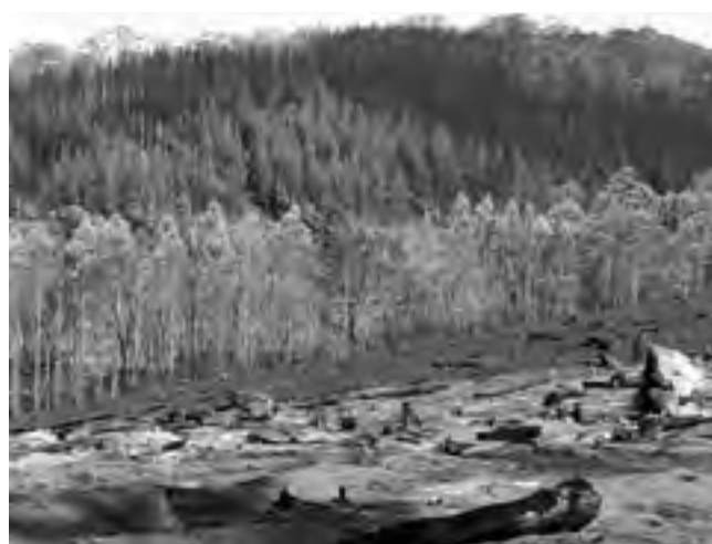
Given plant tissue is killed on exposure to 60°C for one minute, the impact of high-intensity fire is devastating.

A characteristic of the recent mega-fires that burn for weeks and months and cover millions of hectares is that while there may be variation in intensity associated with variation in weather, practically every square metre is burnt. This means that there are very few unburned refuges and ensures that any animals that survive the passage of the fire front will die later from starvation.