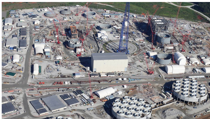
The abandoned V.C. Summer nuclear project in South Carolina. A number of utility and company executives have been charged with crimes – this is known as the 'Nukegate' scandal. 292

* France: The latest cost estimate for the one and only reactor under construction is €19.1 billion (A$31.0 billion) or €11.9 billion ($A19.4 billion) / GW. 291