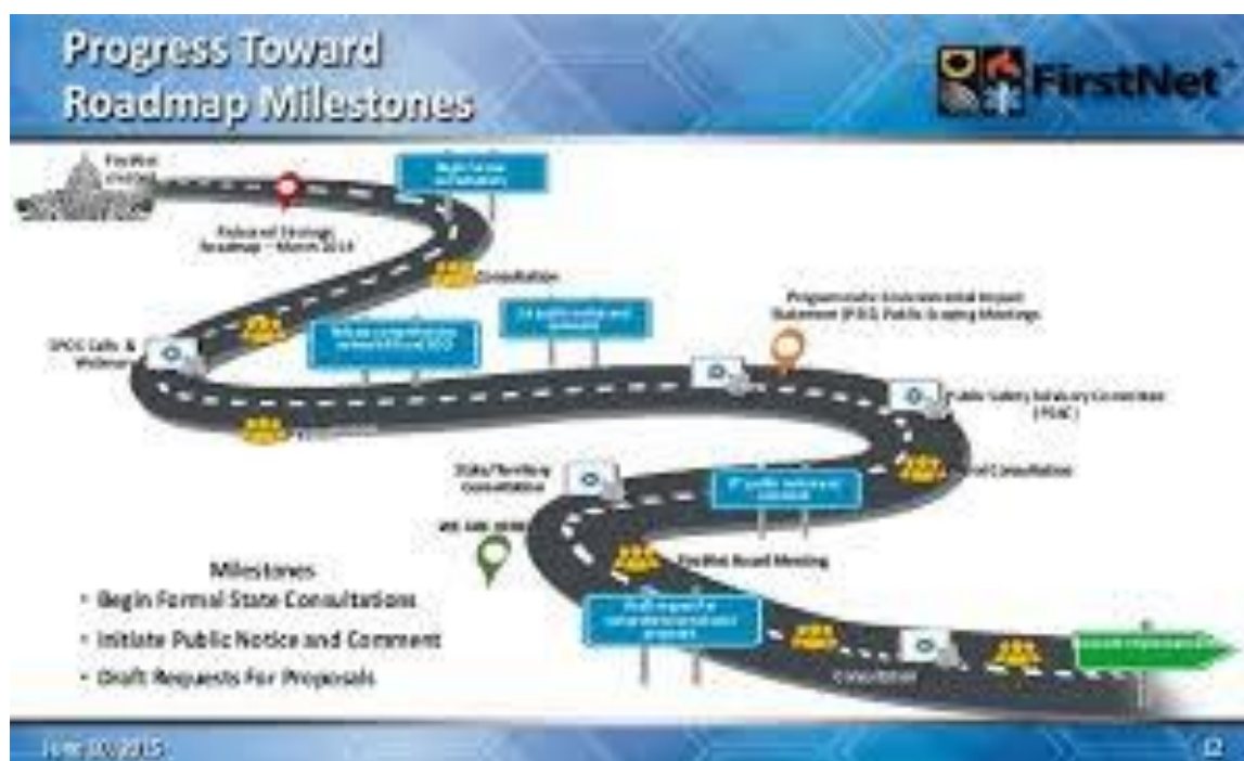
Figure No 3: FirstNet Roadmap

In Europe Public Safety Communications Europe (PSCE) produced a Transition Roadmap 36 for the European Union Interoperable Broadband and Communication Applications and Technology for Public Safety specification through a twelve month process of consultation with public safety representatives from 15 European Countries and NPSTC from the USA.