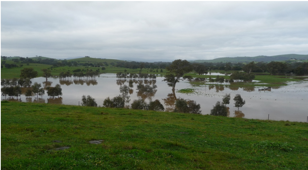
PORTION OF YEA RIVER FLATS AT "CHEVIOT HILLS" AUGUST 2010

High, prolonged and frequent environmental flows in the Goulburn River will restrict floodwaters in tributaries such as the Yea River, from draining quickly and freely as normally occurs. This means our river flats will be inundated for longer periods causing severe impacts on pasture, silage production, fertiliser application and cattle finishing during the Spring, when the proposed environmental flows are to occur.