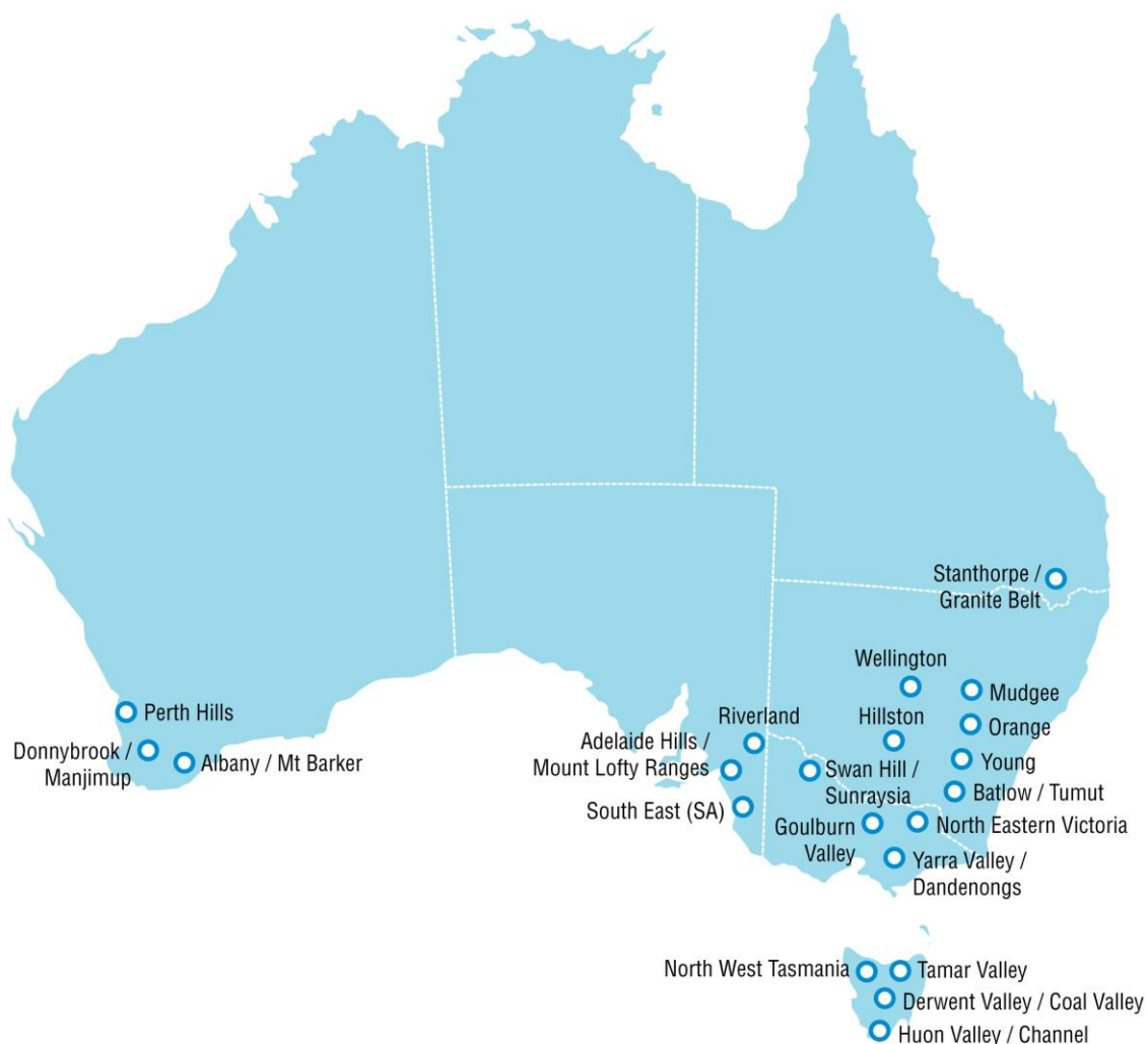
Figure 1: Australian cherry growing regions.

Tasmania, as a whole, is an internationally recognised Pest Free Area for both Queensland fruit fly and Mediterranean fruit fly.