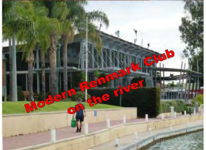
Modern Renmark Club on the river