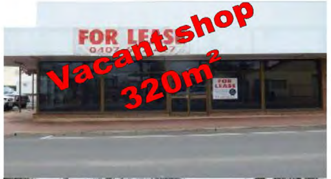
Vacant shop 320m 2