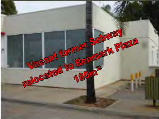
Vacant former Subway relocated to Renmark Plaza 180m 2