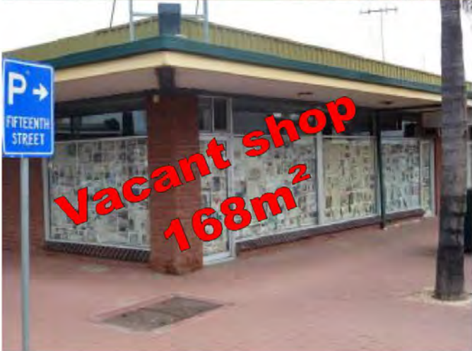
Vacant shop 168m 2