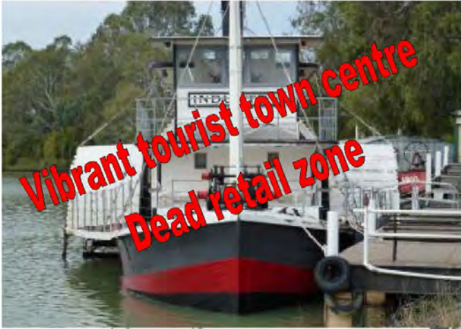
Vibrant tourist town centre Dead retail zone