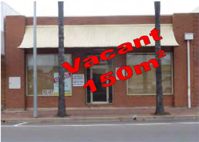
Vacant 150m 2