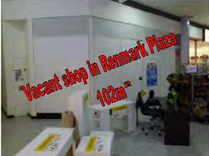
Vacant shop in Renmark Plaza 102m 2