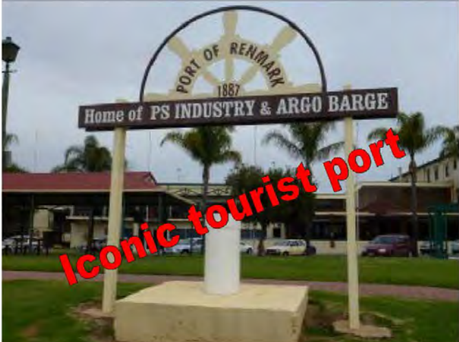
Iconic tourist port