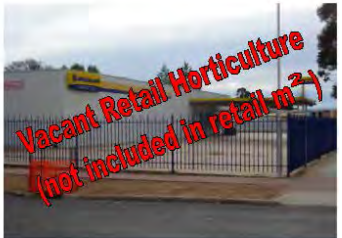
Vacant Retail Horticulture (not included in retail m 2 )