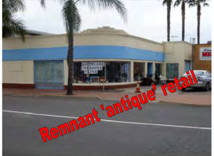
Remnant 'antique' retail