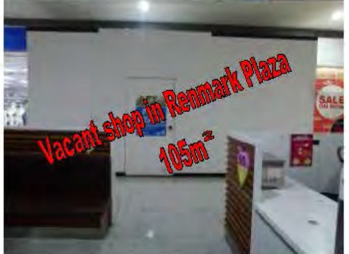
Vacant shop in Renmark Plaza 105m 2