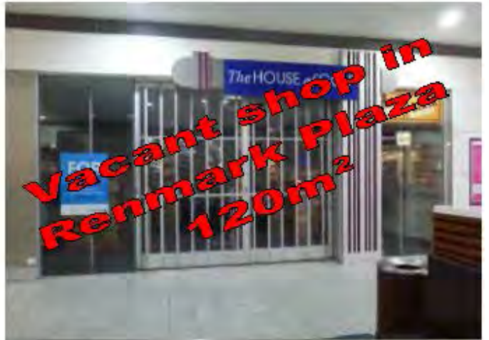
Vacant shop in Renmark Plaza 120m 2