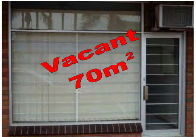
Vacant 70m 2