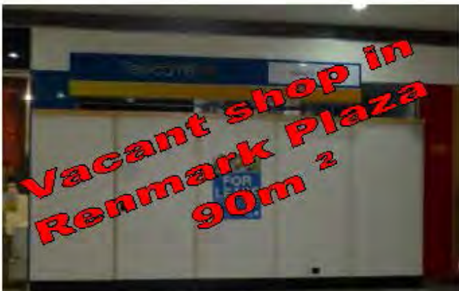
Vacant shop in Renmark Plaza 90m 2