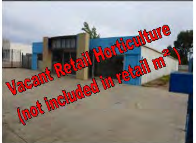
Vacant Retail Horticulture (not included in retail m 2 )