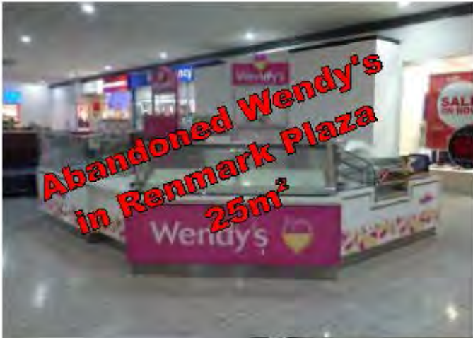
Abandoned Wendy's in Renmark Plaza 25m 2