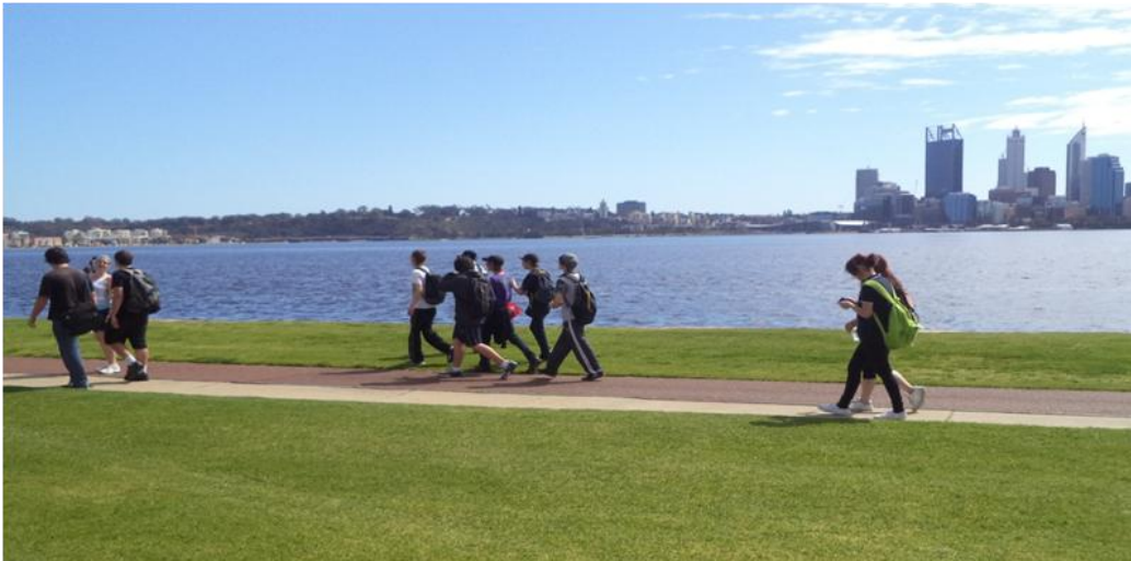
SMYL College students and staff on our 8km City Bridges Walk

Welcome to the SMYL College, Term 3 newsletter.