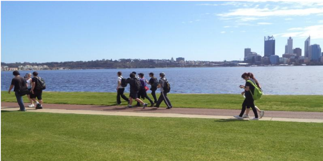
SMYL College students and staff on our 8km City Bridges Walk

Welcome to the SMYL College, Term 3 newsletter.