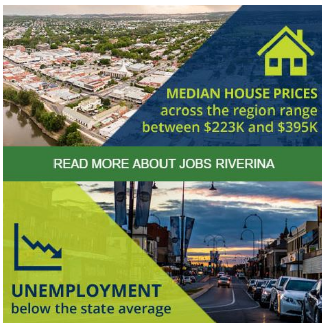
Figure 4 Median House Prices and Unemployment in the Riverina. Jobs Riverina https://www.jobsriverina.com.au/

As noted in Figure 3, The Riverina offers a diverse range of facilities, services and jobs with affordable housing, low congestion and a good work/life balance. Despite these factors, many people in metropolitan Australia are unaware of the opportunities available in regional areas. The Country Change platform and program promotes the competitive advantage of the Riverina region and the specific situation and offering of each of the Riverina's towns. Our platform Jobs Riverina allows employers to advertise jobs in the region at no cost and potential employees to search for jobs and post an air CV. This is of benefit to all.