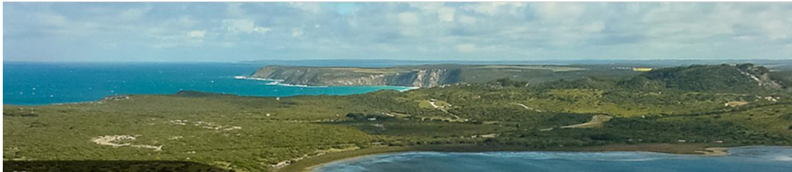
Figure 1: View of Pelican Lagoon, Prospect Hill and Pennington Bay at the connection between east and west Kangaroo Island

Similarly, the State Government establishes task forces to drive through development such as the Olympic Dam Taskforce, the Regional Mining and Infrastructure Task Force. There are even task forces to case manage development proposals such as the Golf Course and Convention Centre on Kangaroo Island which demonstrate the extent of the State Governments conflicts of interest in assessing and approving development proposals.