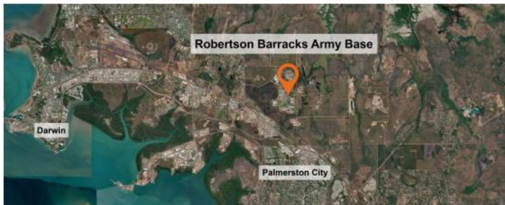
Location of Robertson Barracks

The Robertson Barracks Base Improvements Project aims to provide essential upgrades to facilities and infrastructure to support the Australian Defence Force and allied partners. When completed, the Project will provide Robertson Barracks with new living-in accommodation, increased messing capacity, as well as upgraded water and electrical infrastructure.