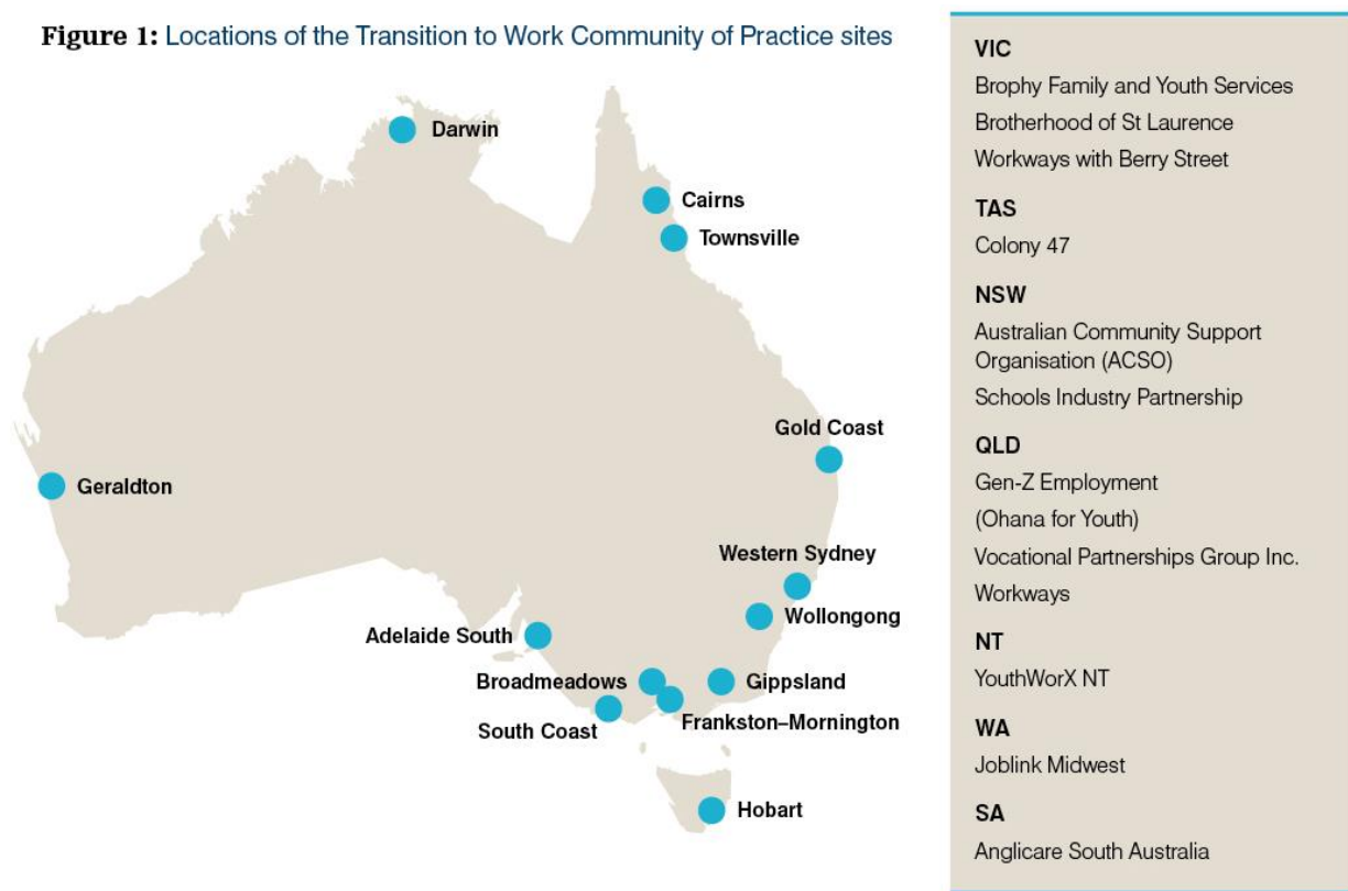
Figure 1: Locations of the Transition to Work Community of Practice sites

Collectively the TtW CoP represents almost one quarter of all TtW providers, and delivers TtW to approximately 3,600 young people per year across the country. To date, the TtW CoP has achieved over 1,800 employment and education outcomes for young people, with over half of those young people still employed six months later.