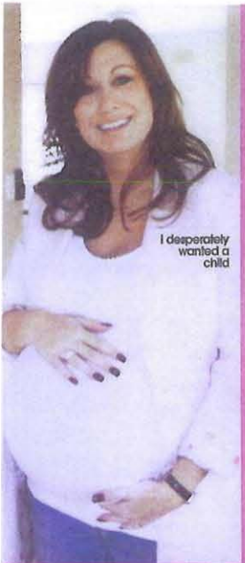
I desperately wanted a child