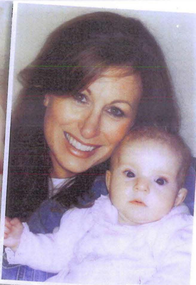
I've never regretted my decision

Three days later the clinic called to say the frozen sperm had arrived. They tested me to see when I was ovulating, and a week later, the nurse injected the sperm into my uterus in a procedure called intra-uterine insemination.