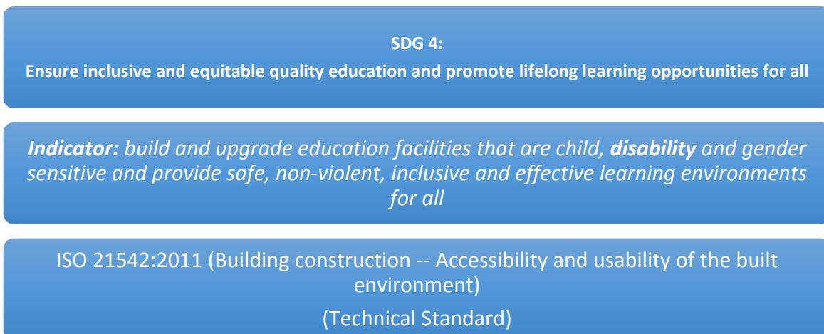
Figure two: Standards and the SDGs - A snapshot of how alignment with indicators can enable implementation

At a more granular level, the respective SDG indicators provide a natural point for alignment between desired outcomes and standards, as depicted below in relation to SDG 4 and International Standards in the building and construction sector. This is the level, we argue, where the value of standards can be clearly understood, moving from a broad aspiration to specific implementation.