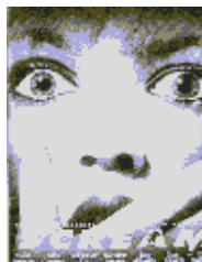
Scream Video Cover

A 10 year-old is in a psychiatric ward with a severe trauma after watching a violent video. Doctors say her mind is "trapped inside" the movie. The girl from a south-eastern Melbourne suburb, watched the horror movie Scream at a sleepover birthday party with other children. Doctors say she began role-playing characters in the movie and became extremely violent. Two other children who saw the movie, which has a Mature Audience classification, have suffered regular nightmares.