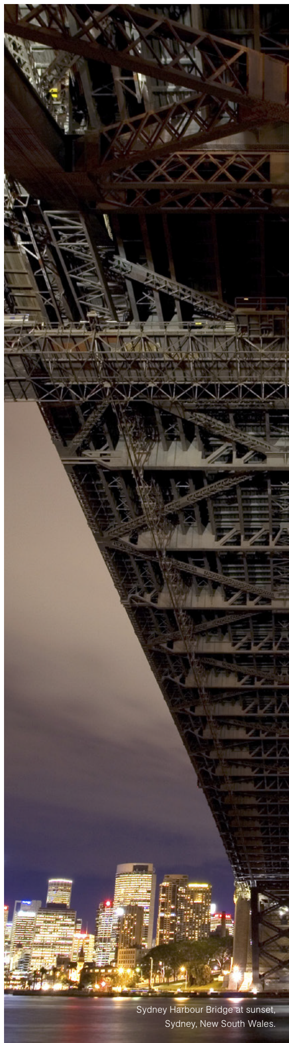
Sydney Harbour Bridge at sunset, Sydney, New South Wales.

The ACT Government plans to build a 140-bed sub-acute hospital on the campus of the University of Canberra. The facility will provide a range of rehabilitation services, treat various mental health conditions and provide targeted care for ageing Canberra residents.