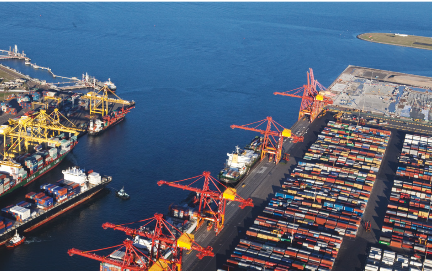
Port Botany, Sydney, New South Wales.