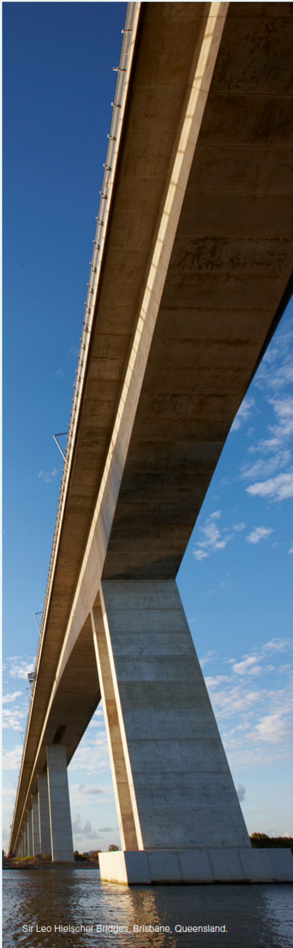
Sir Leo Hielscher Bridges, Brisbane, Queensland.