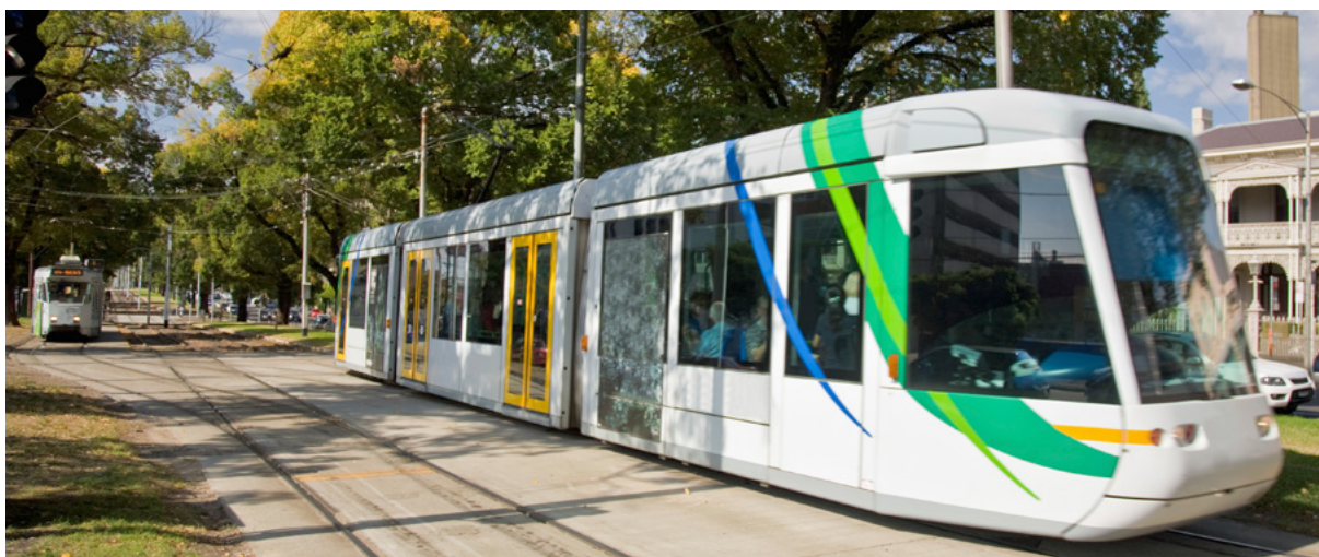
Melbourne tram in Victoria Australia.

French transnational company Veolia Environnement provides an array of solutions related to water, energy and materials – with a focus on waste recovery – to promote Australia's transition toward a 'circular economy'. In partnership with John Holland, Veolia Environnement designed and built the Sydney Desalination Plant in 2010 and is now operating and maintaining the plant under a long-term contract. The company also retains a significant stake in Transdev Australasia – a joint partner in Harbour City Ferries. In July 2012, the NSW Government awarded Harbour City Ferries a franchise contract to operate the services of Sydney Ferries.