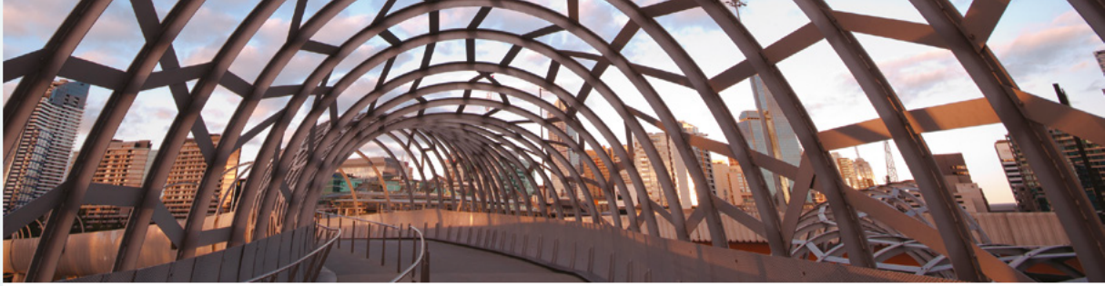
Webb Bridge, Melbourne, Victoria.