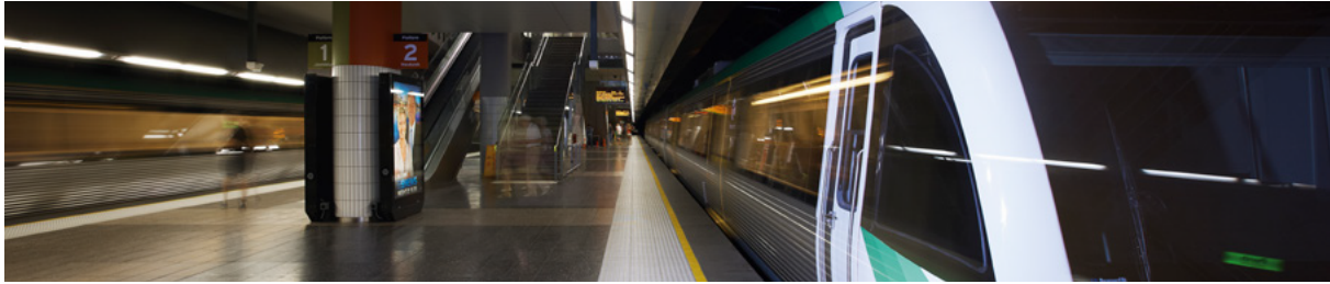
Rail crossing, Western Australia.