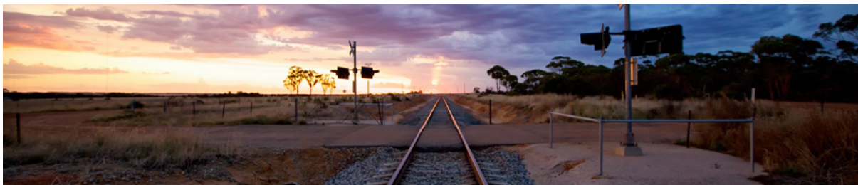
Rail crossing, Western Australia.