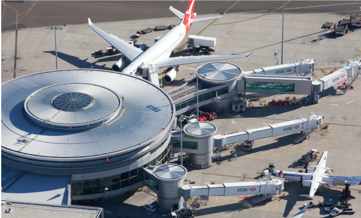
Sydney Airport, New South Wales.

Opportunities exist for private financiers to invest in Australian airports, including existing federal government–leased airports and existing private airports. As state and local governments examine the possibility of privatising regional airports, or seek private investment to upgrade regional airports, further opportunities may become available.