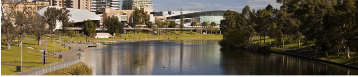
Adelaide cityscape, Adelaide, South Australia.