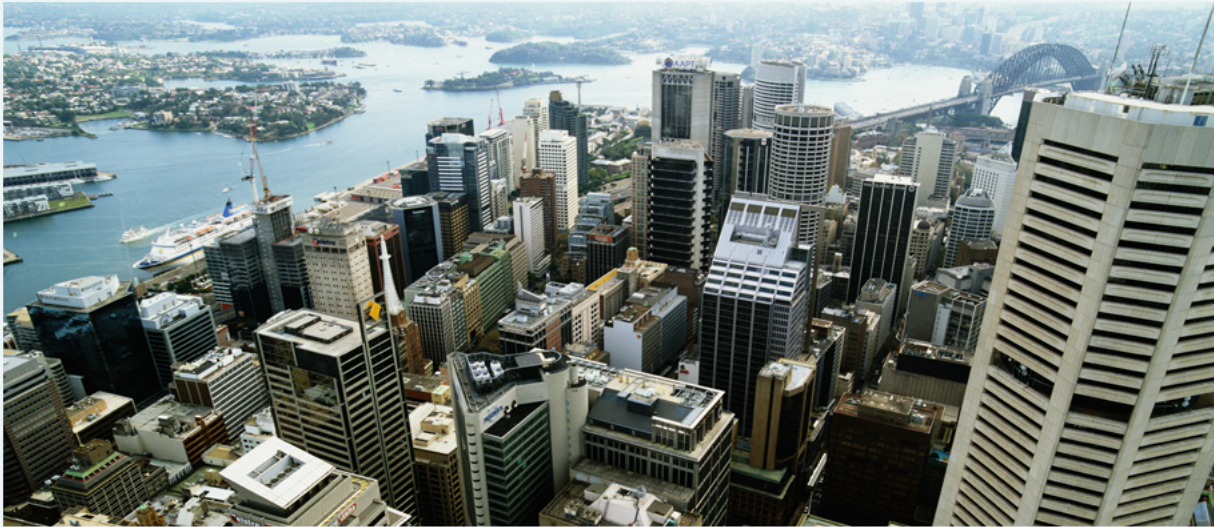
Sydney office buildings, aerial view.