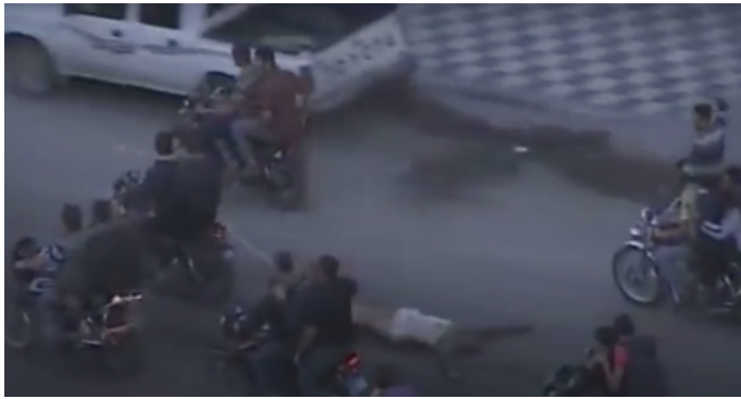
Hamas mob drags body by motorcycle through streets of Gaza

In 2006, the year after Israel withdrew its entire civilian and military presence from Gaza, Hamas won the legislative elections in the Gaza Strip. A year later, it reinforced its authority by coercively ousting its rival, Fatah, from the territory, including by murdering hundreds of Fatah members in what is known as the Battle of Gaza, described locally at the time as a “civil war”. Since then, Hamas has ruled the Gaza Strip as a dictatorship. The territory has been blockaded by Egypt and Israel — its two bordering nations — since Hamas forcibly took complete power in 2007.