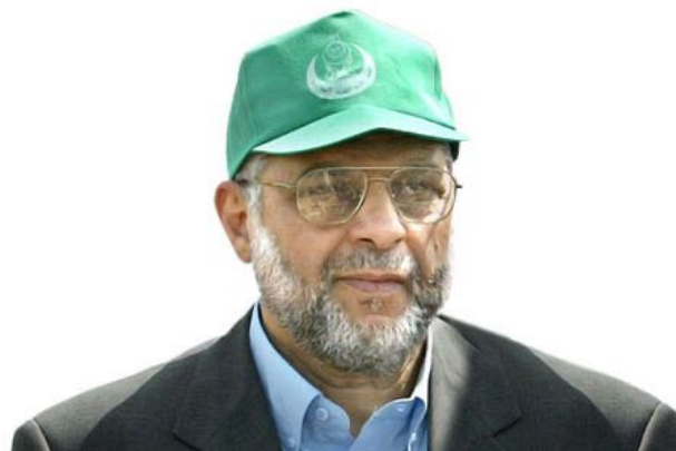
Abdel Aziz al-Rantisi

hand of the [Izz al-Din al-Qassam] brigades to do whatever they want against the brothers of monkey and pigs", referring to Jews.