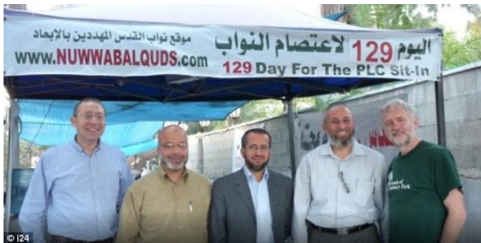
Jeremy Corbyn MP and Andy Slaughter MP pose with Hamas officials in Ramallah

Mr Corbyn has previously referred to Hamas as his friends. For example, in a speech to a Stop the War Coalition event in 2009, Mr Corbyn described Hamas (and the terrorist group Hizballah) as his "friends", saying it would be his "honour and pleasure" to host their operatives in Parliament. In 2016, under pressure over antisemitism in his Party, Mr Corbyn said that he regretted his words.