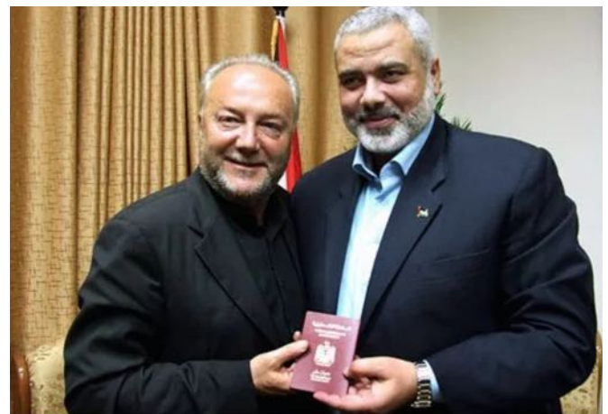
George Galloway receives a passport from Hamas Prime Minister Ismail Haniyeh

In 2009, Mr Galloway was reportedly described by one Hamas official as a "hero" and was awarded a passport by the Hamas Prime Minister, Ismail Haniyeh, in "deep appreciation" of his support.