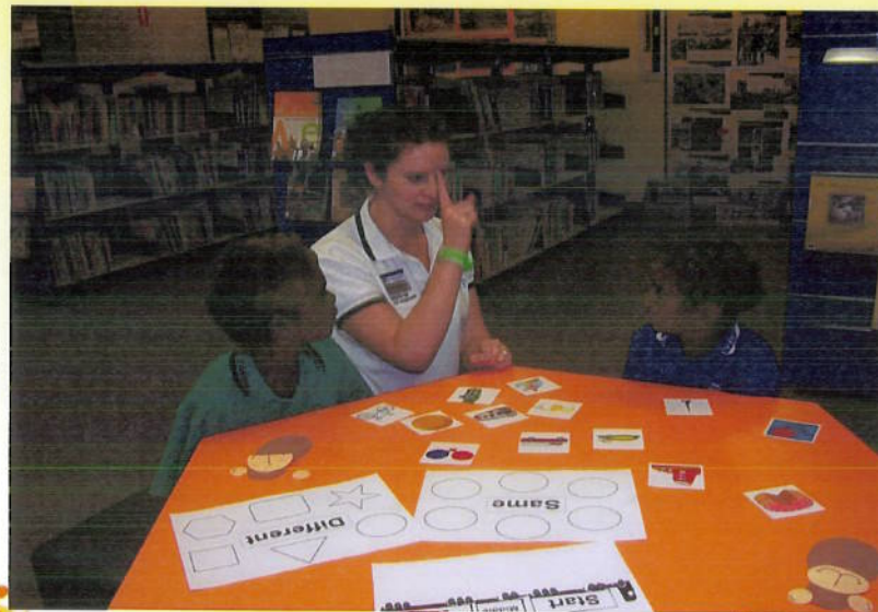
Katherine NT Speech Pathology Pilot 2013