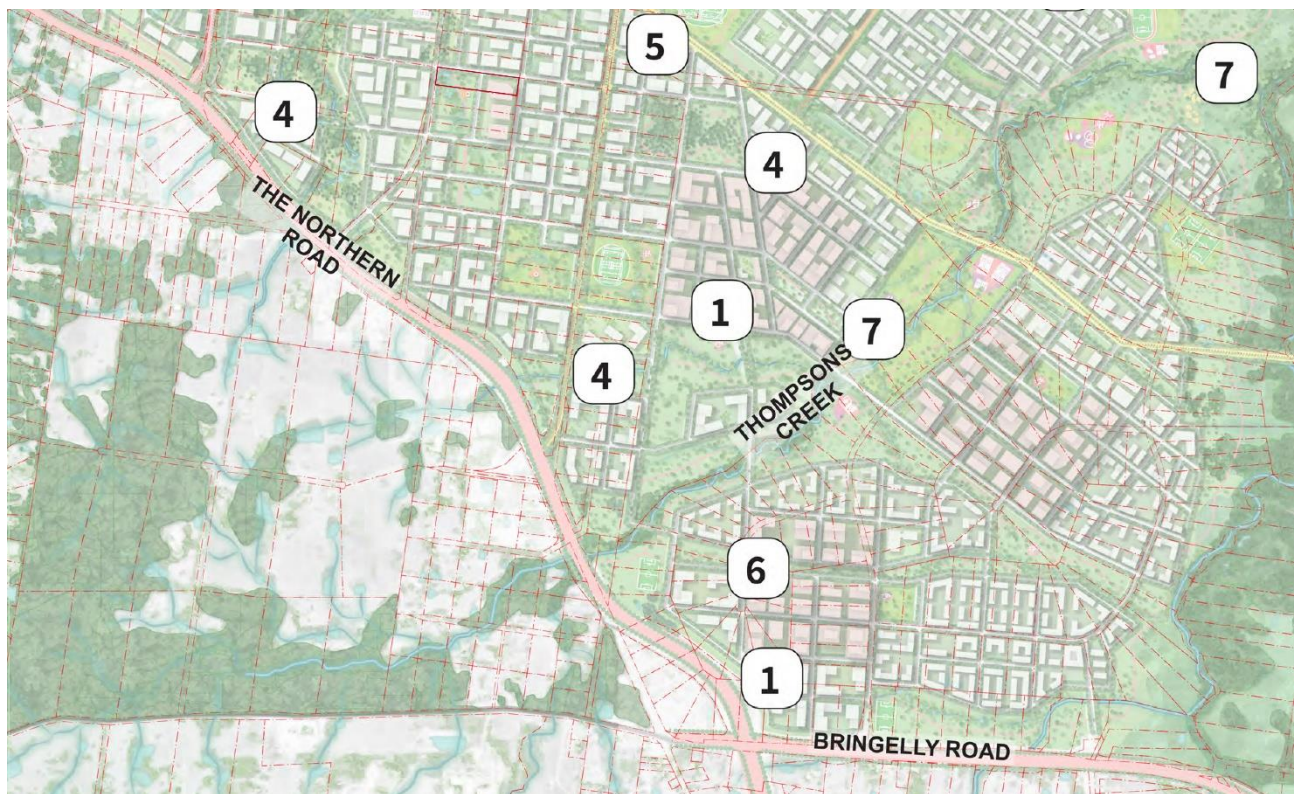
Figure 1 Location of properties on Western side Badgerys Creek Rd

This report and or parts of this report were prepared by Planning Ingenuity Pty Ltd. It contains extracts from a report presented by the ABC and the property owners on Badgerys Creek Road, and Derwent Roads Bringelly, affected by the proposed Parklands exhibited in the Draft Precinct Plans for the "Aerotropolis Core" of the Western Sydney Aerotropolis. My property is located at: