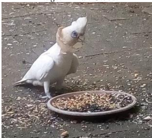
This corella was found with a dome-shaped plastic lid around its neck. Unfortunately, there was not a happy ending for this little corella.