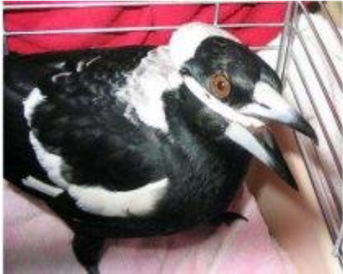
This magpie was lucky to be found before starving to death. Many birds do not fare so well. They succumb silently, in agony, and out of sight.

Below are a couple of examples of the victims of these rings: