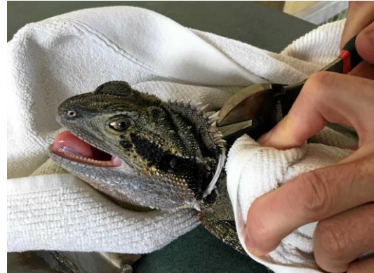
This water dragon got his head stuck in a plastic ring of a discarded bottle and would have slowly starved to death if it had not been rescued.