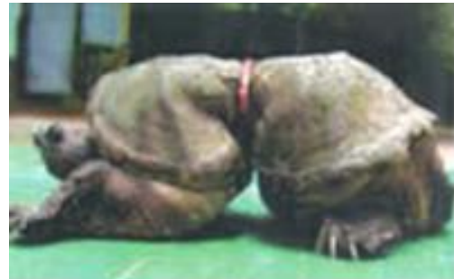
This turtle has been deformed. It could not break this plastic belt around its waist as it grew, and its shell is now permanently deformed.