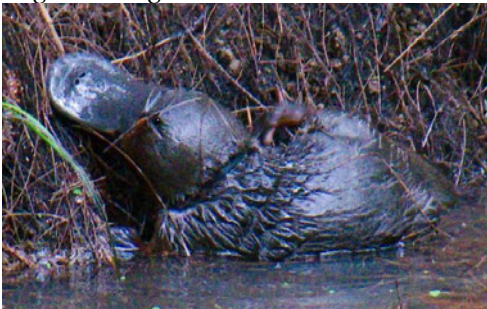
This platypus was spotted with a plastic ring around its neck and would have succumbed to significant injuries if not rescued.