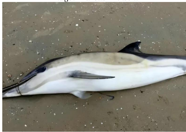
This short-beaked common dolphin starves to death after being unable to open its mouth from discarded twine-like plastic caught around the dolphin's beak.