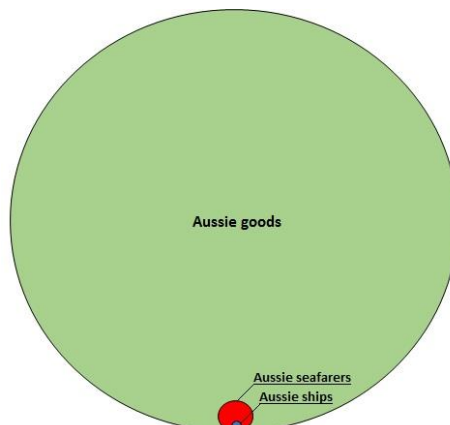
Figure 2: Relative public benefit of individual objectives

A conservative estimate of the magnitude of the relative benefits of the objective is represented in Figure 2.