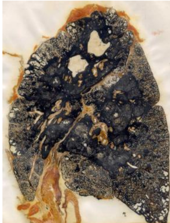
Specimen of lung with Progressive Massive Fibrosis