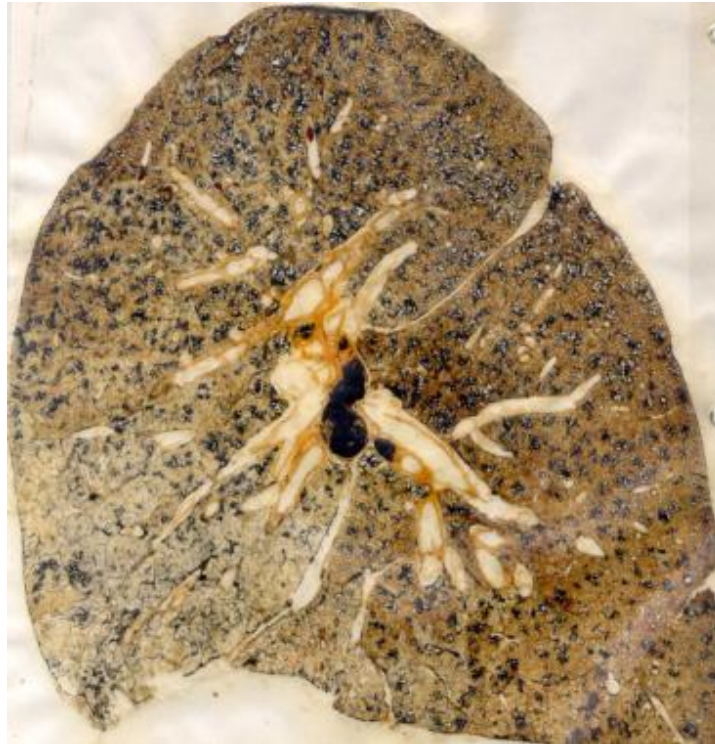
Specimen of lung with simple CWP