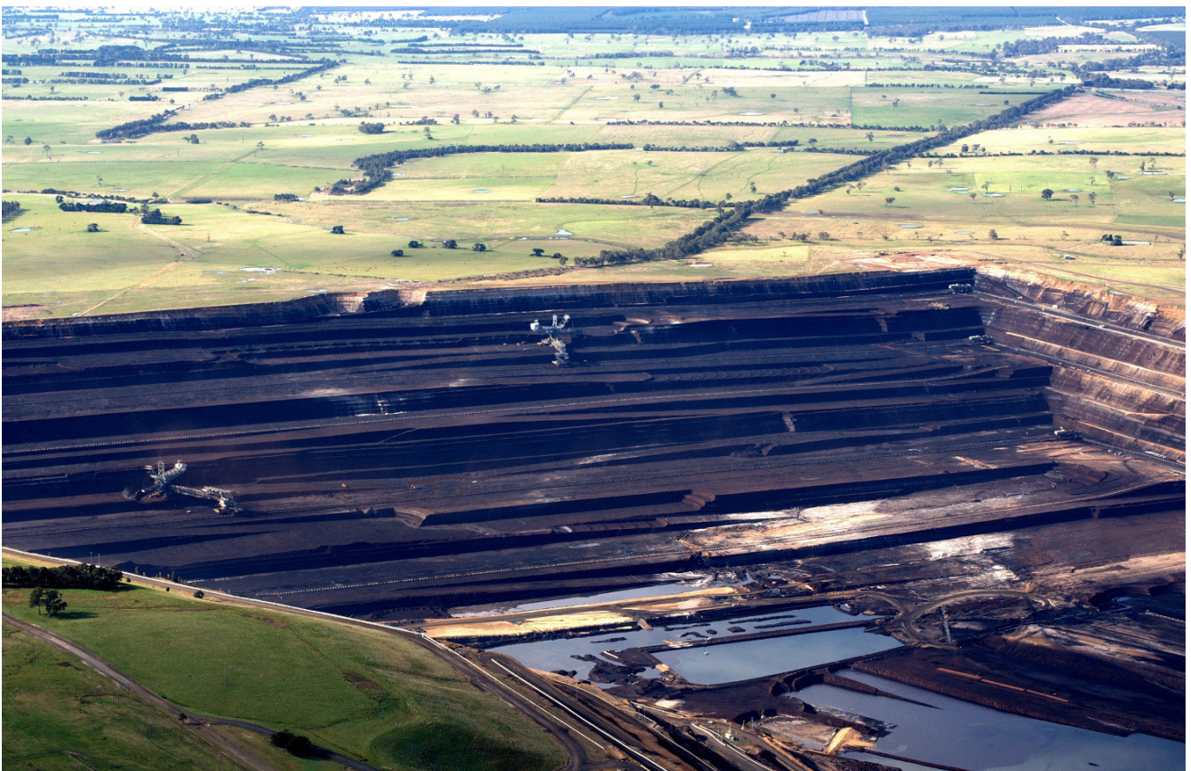
Loy Yang coal mine covers 800 hectares in Victoria's Latrobe Valley.

“Projects that have an environmental impact also pose a human health risk because the two are inextricably linked.”