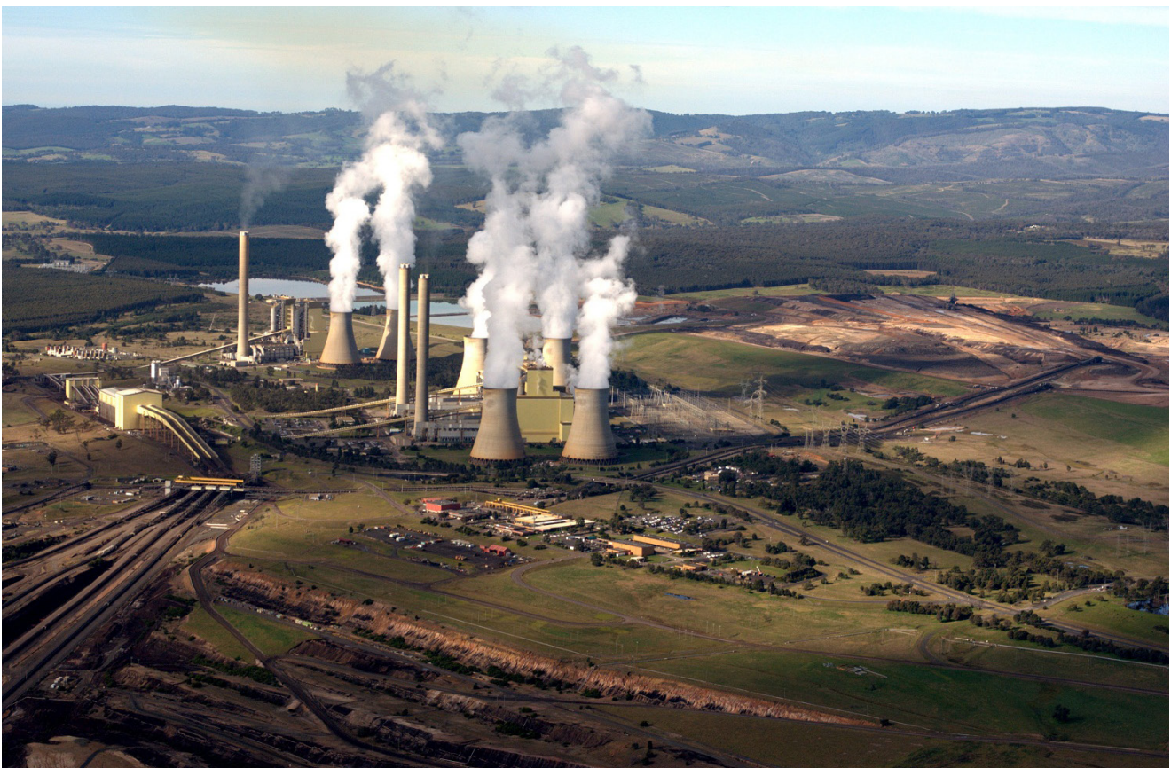
Loy Yang power, Victoria.

The state standards for sulphur dioxide (AAQ SEPP) relate to the national air quality standards (AAQ NEPM) which were set 14 years ago. In recent years there have been extensive reviews of the health impacts of sulphur dioxide