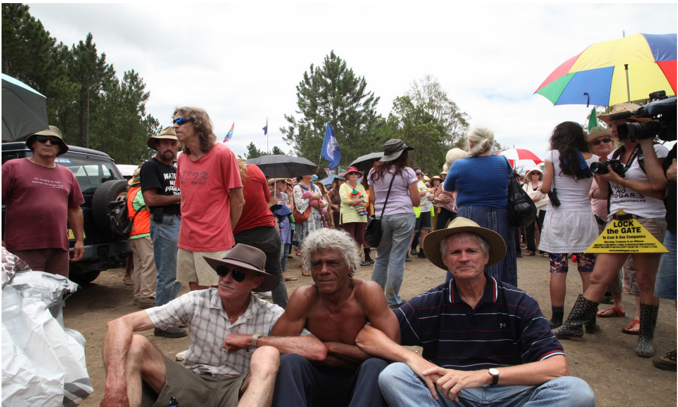
Communities around Australia have galvanised in attempts to prevent under-regulated coal and CSG projects from polluting their areas.

“History will not look kindly on the Federal and State Government failures to protect human health.”