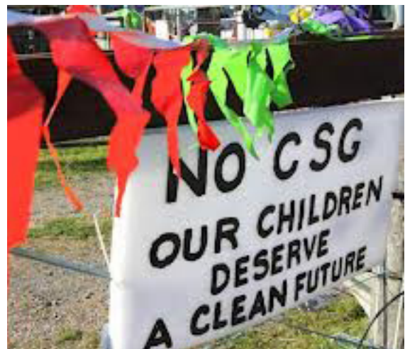
Hunter Valley Protection Alliance 2013.

The NSW government restricted input from stakeholders and placed the decision in the hands of one arbiter within the Planning Commission to ensure approval. At time of this report, the T4 project is deferred.