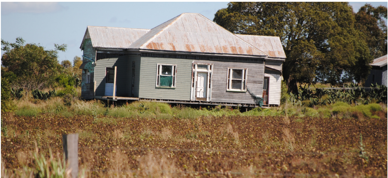
One of 70 farms abandoned in Acland Queensland since the mine started operating