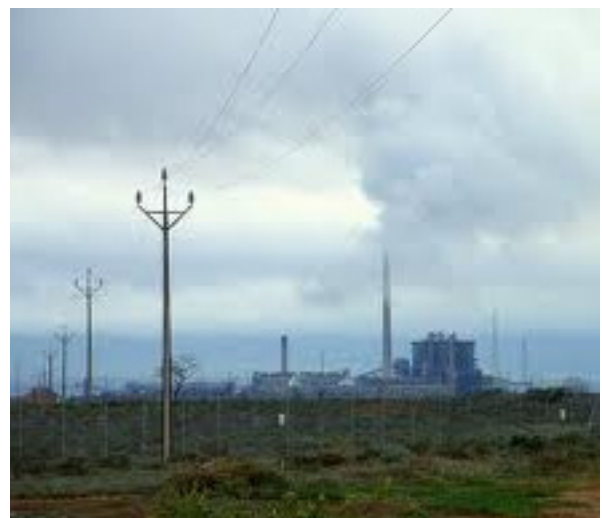
Port Augusta Power station

years it has continued operating at the expense of human health. The true cost of this power is not properly measured. See article Illness and Pollution at Port Augusta; Doctors Prescribe Solar Thermal Treatment . 1