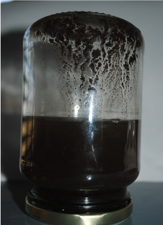
Coal particles from a patch of roof washed approx half a kilometre from coal train line. Queensland

we have failed to heed the lessons. Governments cut corners to get new coal mines and fail to monitor existing mines.