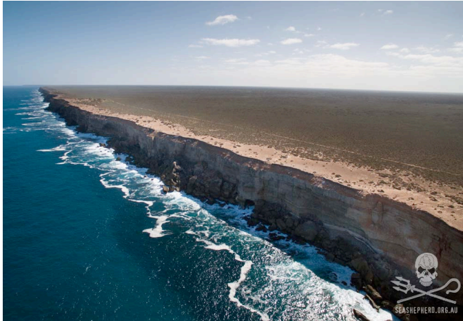
Bunda cliffs – whale nursery