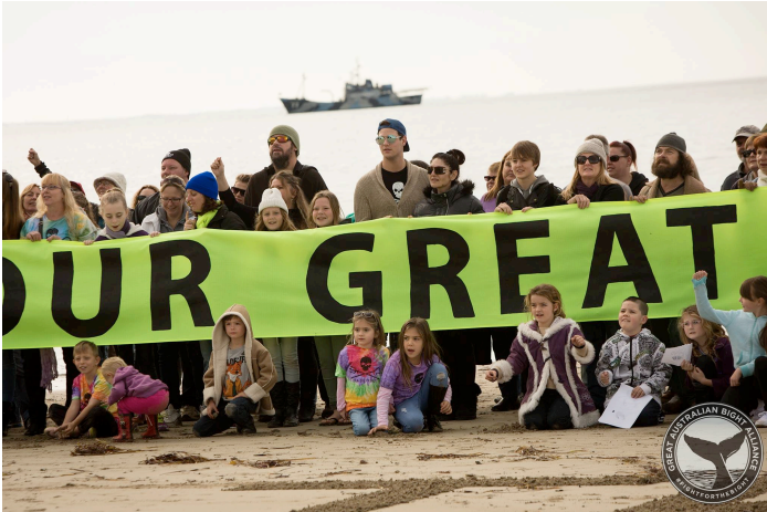
Victor Harbor Greeting