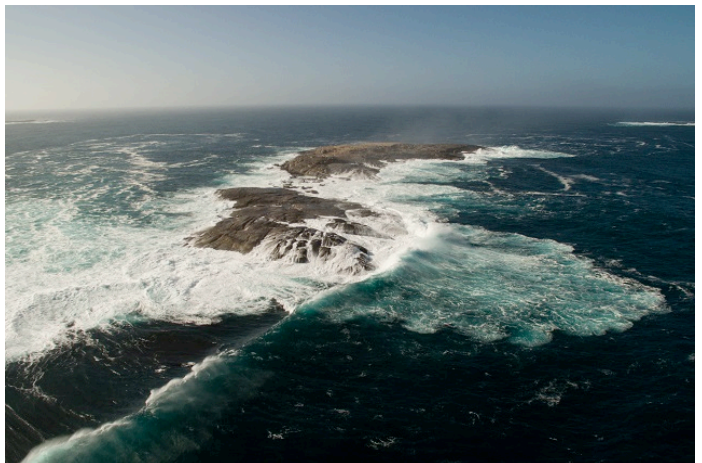
Nuyts Reef – Great Australian Bight

With Sea Shepherd I have been lucky enough to visit the Galapagos and I must say that what I witnessed in the Great Australian Bight is on par with the Galapagos, and therefore worthy of World Heritage recognition. The offshore islands, with places like Pearson Island where we were greeted by endangered Australian sea lions and black footed rock wallabies, which are endemic to Pearson. We felt like early explorers. We had to get permits from the South Australian Government to visit and film these places, not to mention many of them are marine sanctuaries.