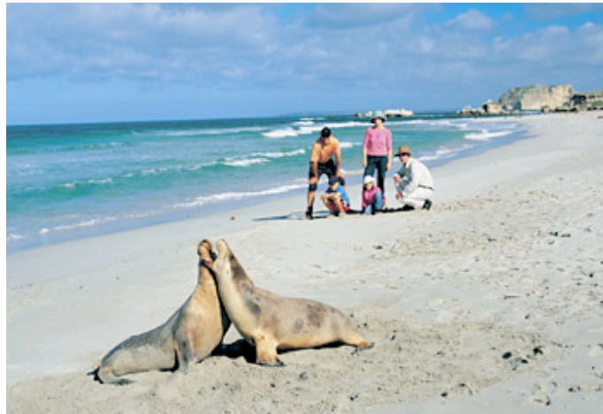
Seal Bay – Kangaroo Island

The majority of global oil spills occur during the exploratory phase. The Deep water horizon disaster was exploratory and BP's plan in the Bight that was with NOPSEMA was also exploratory .