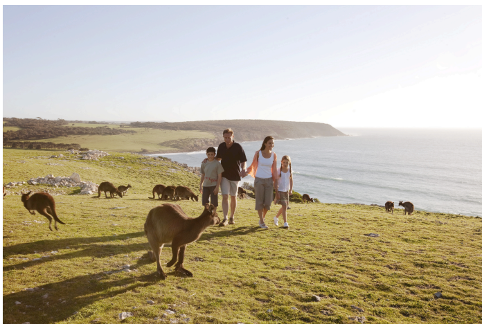
Kangaroo Island Kangaroos