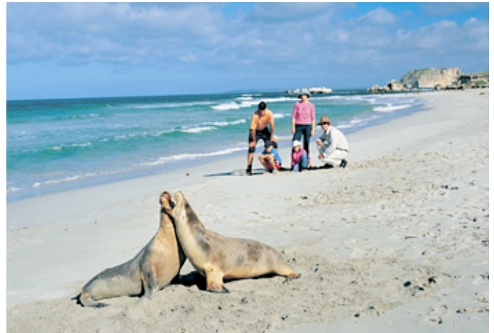
Seal Bay – Kangaroo Island

The majority of global oil spills occur during the exploratory phase. The Deep water horizon disaster was exploratory and BP's plan in the Bight that was with NOPSEMA was also exploratory .