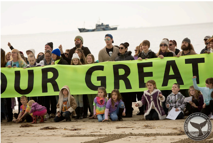
Victor Harbor Greeting