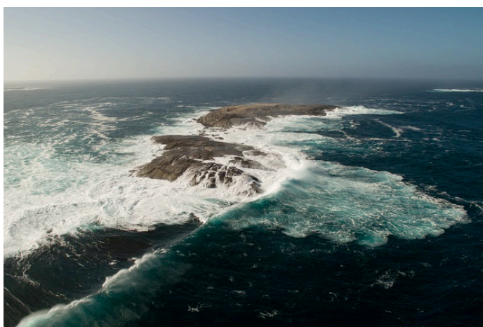
Nuyts Reef – Great Australian Bight

With Sea Shepherd I have been lucky enough to visit the Galapagos and I must say that what I witnessed in the Great Australian Bight is on par with the Galapagos, and therefore worthy of World Heritage recognition. The offshore islands, with places like Pearson Island where we were greeted by endangered Australian sea lions and black footed rock wallabies, which are endemic to Pearson. We felt like early explorers. We had to get permits from the South Australian Government to visit and film these places, not to mention many of them are marine sanctuaries.