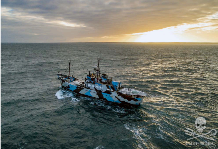
Steve Irwin off Bunda Cliffs – Great Australian Bight