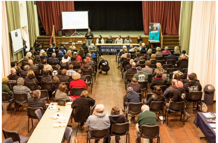
Council led community forum – Kangaroo Island

One thing that we were really not expecting was the level of support that we got as the Steve Irwin pulled into various key location, like Victor Harbor, Port Adelaide and Kangaroo Island. The worry, stress and strain that drilling for oil in the Bight has on many individuals was clearly evident with at times people breaking down and crying. People with deep concern for the potential loss of the natural beauty they have held so dear of their home from a young age, to the fact that their livelihood depends on healthy oceans and or tourism. It was also very humbling; inspiring and overwhelming the hope that many people we met had placed on our combined campaigns successful outcome. These are all very real and important impacts that should always be taken into account.