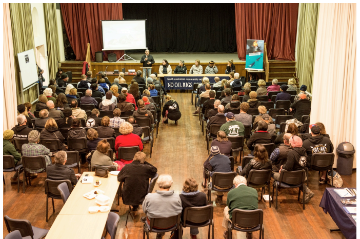
Council led community forum – Kangaroo Island

One thing that we were really not expecting was the level of support that we got as the Steve Irwin pulled into various key location, like Victor Harbor, Port Adelaide and Kangaroo Island. The worry, stress and strain that drilling for oil in the Bight has on many individuals was clearly evident with at times people breaking down and crying. People with deep concern for the potential loss of the natural beauty they have held so dear of their home from a young age, to the fact that their livelihood depends on healthy oceans and or tourism. It was also very humbling; inspiring and overwhelming the hope that many people we met had placed on our combined campaigns successful outcome. These are all very real and important impacts that should always be taken into account.