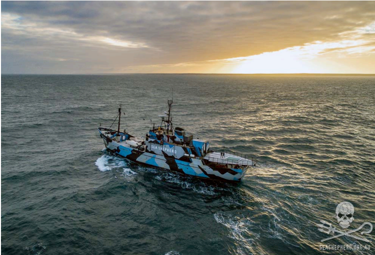
Steve Irwin off Bunda Cliffs – Great Australia Bight