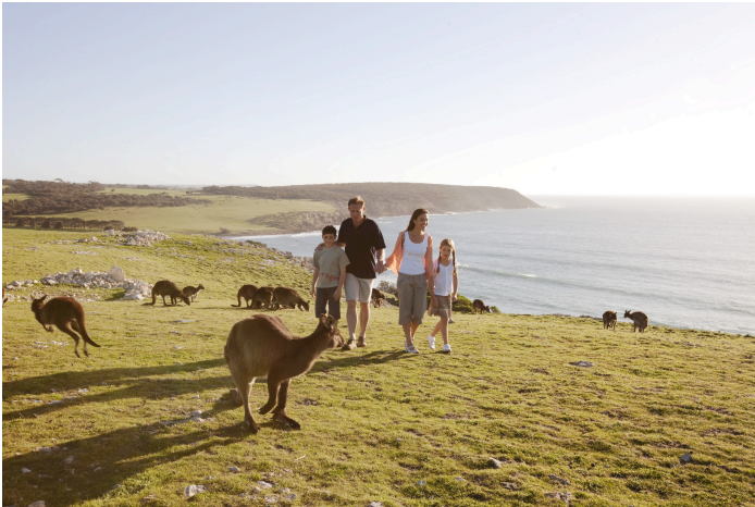
Kangaroo Island Kangaroos