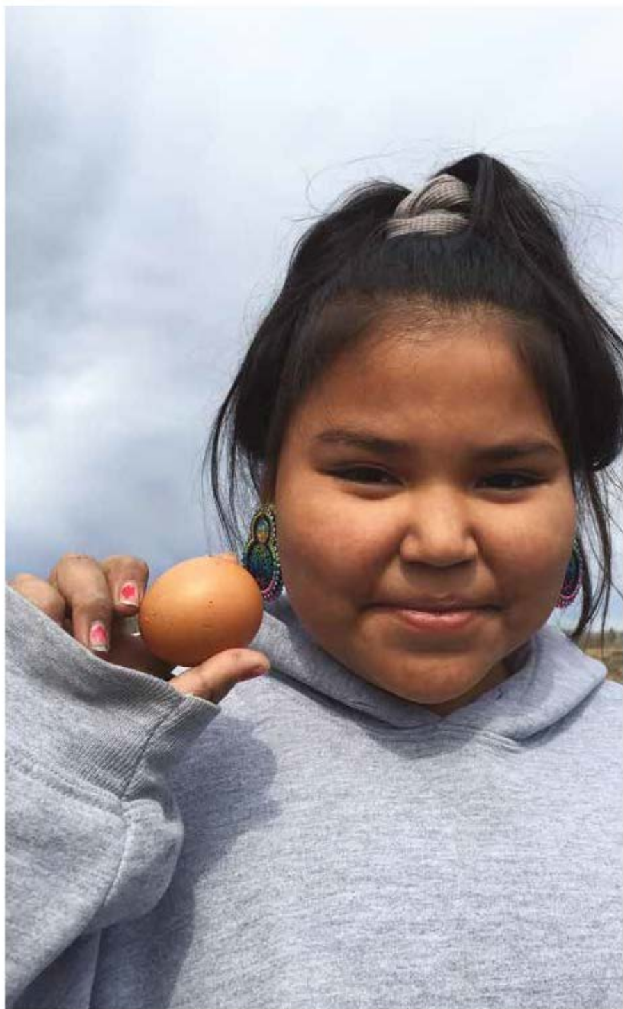
YOUNG GARDEN HILL FARMER, SHOWING OFF FIRST EGG FROM THE CHICKEN COOP.