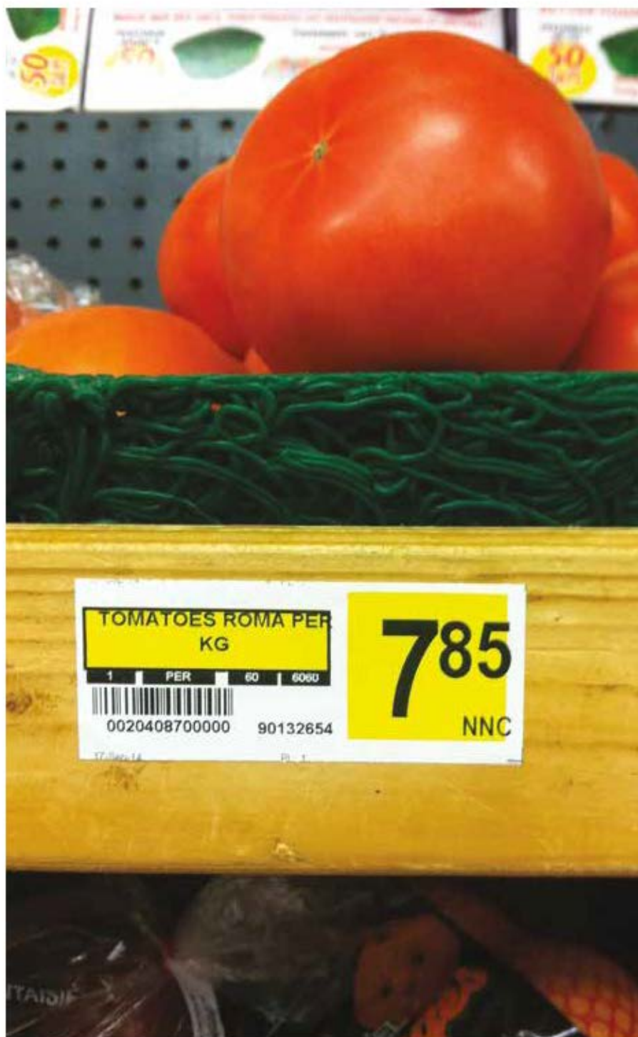
AN EXAMPLE OF AVERAGE PRICE OF FRESH PRODUCE IN REMOTE FIRST NATIONS.