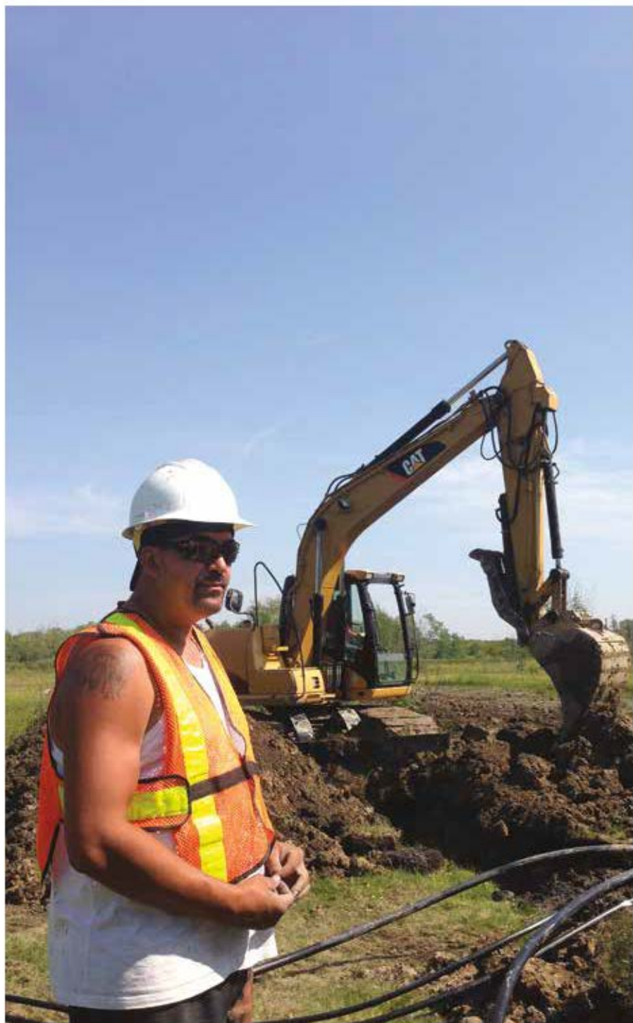
FISHER RIVER BUILDERS INSTALLING GROUND LOOPS FOR GEOTHERMAL HEATING SYSTEMS.