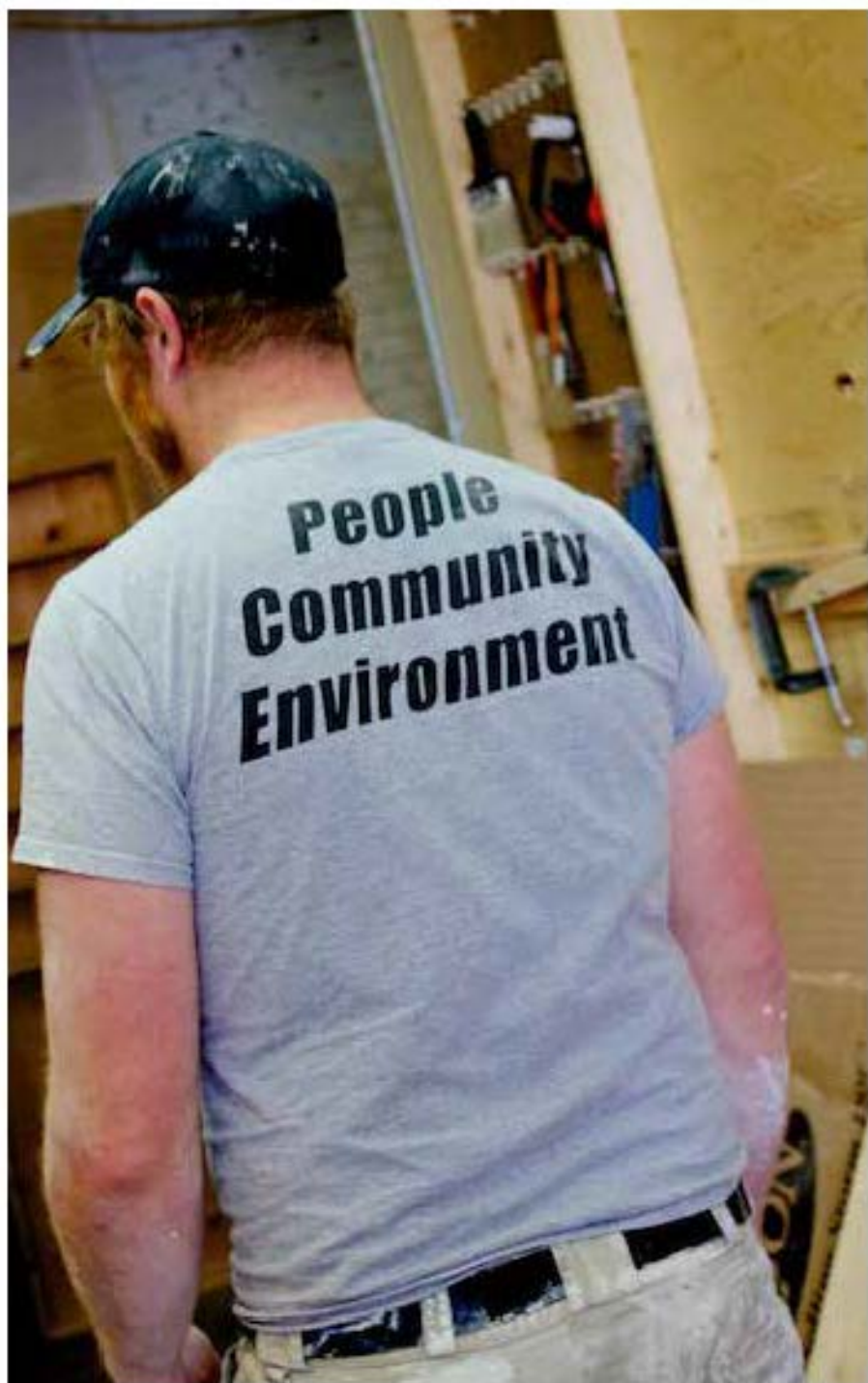
MANITOBA GREEN RETROFIT STAFF SHIRT. WORK UNIFORMS ARE WORN PROUDLY, OFTEN REPLACING GANG COLOURS.