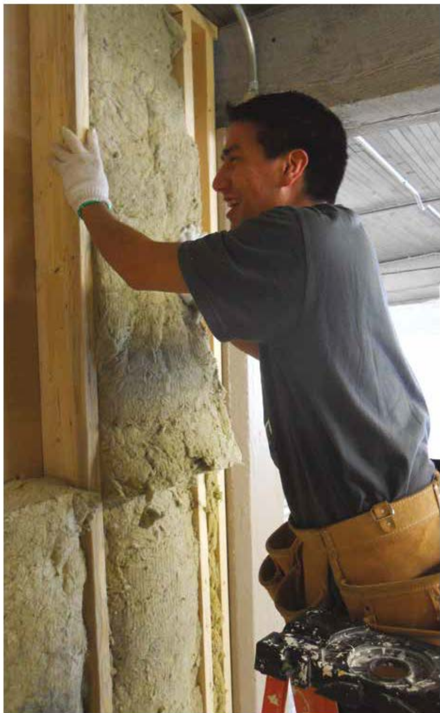
INSULATION TECHNICIANS WARMING UP HOMES IN WINNIPEG TO REDUCE HEATING BILLS.