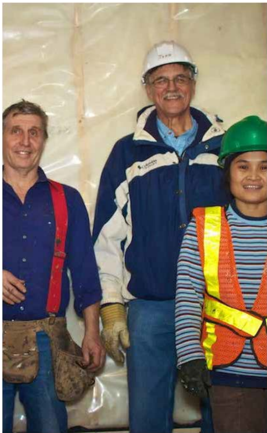
BUILD INC. STAFF ON A COMPLETED JOB SITE.