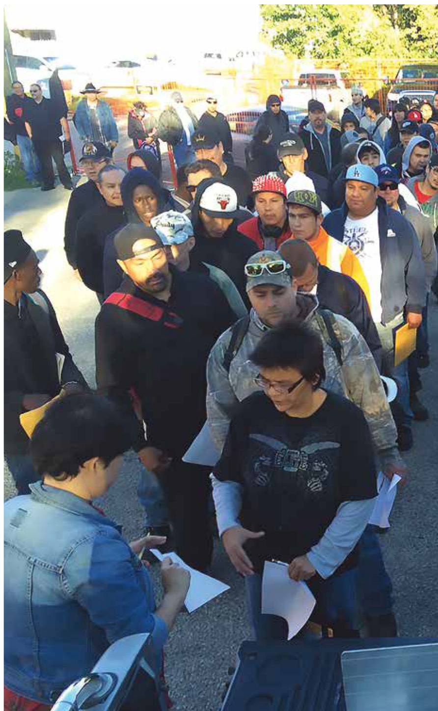
MGR'S OPEN CALL FOR 8 LABOUR POSITIONS AT 7 AM IN WINNIPEG'S NORTH END.