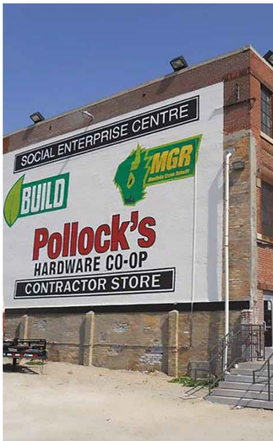
THE SOCIAL ENTERPRISE CENTRE, LOCATED AT 765 MAIN STREET IN WINNIPEG'S NORTH END.