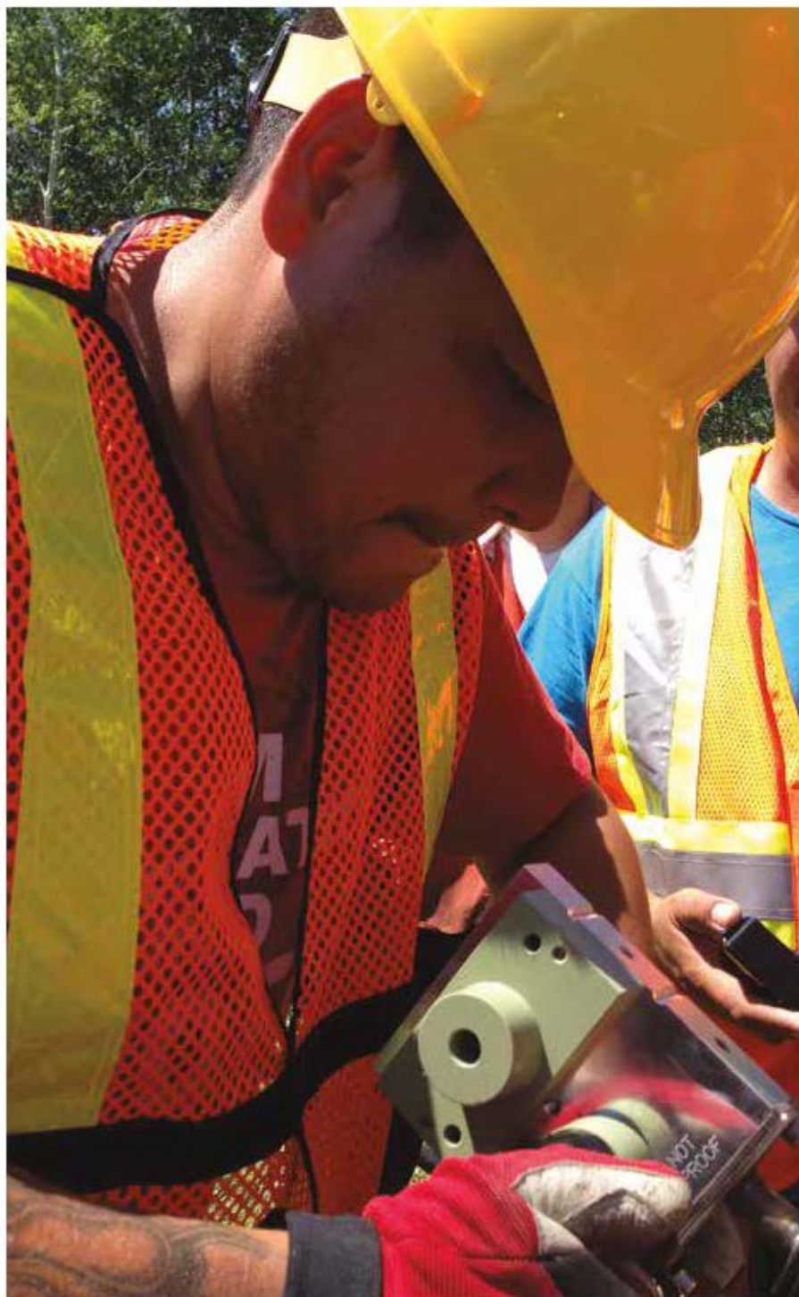
LEARNING AND TEACHING THE TOOLS OF THE TRADE IN FISHER RIVER.