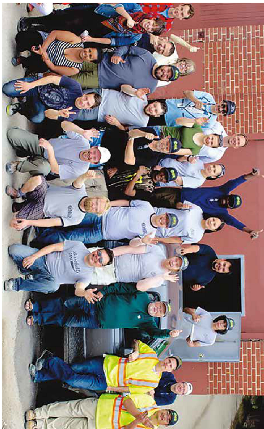
STAFF OF MANITOBA GREEN RETROFIT.