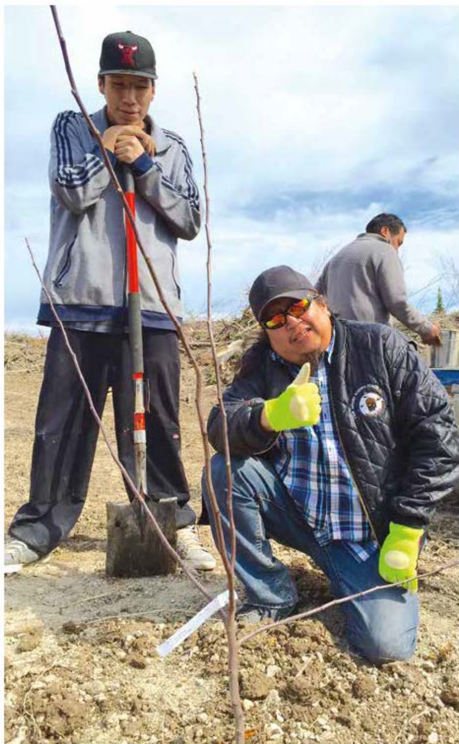
PLANTING THE FIRST TREE FOR THE MEECHIM FARM ORCHARD, IN GARDEN HILL.