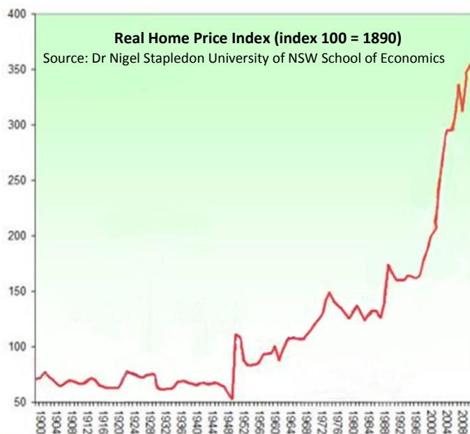
'The most important graph in Australia's history'

As can be seen from the graph, the median house price is now, in real terms ie relative to income, more than nine times what it was between 1900 and 2000. At nine times median household income a family will fork out approximately $600,000 more on mortgage payments than they would have had house prices remained at three times the median income. That's $600,000 they are not able to spend on other things - clothes, cars, furniture, appliances, travel, movies, restaurants, the theatre, children's education, charities and many other discretionary purchase options.