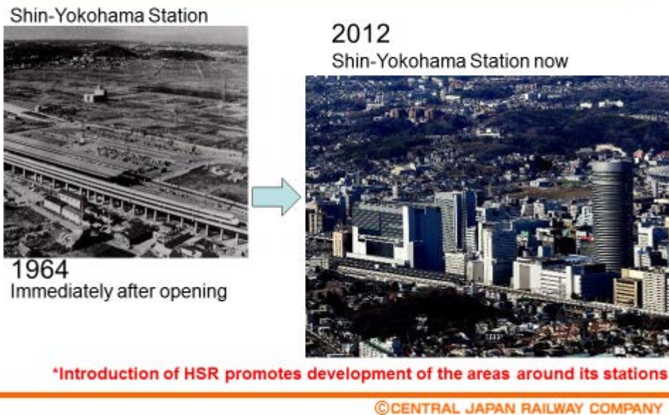
Figure 1 – Promoting development of stations