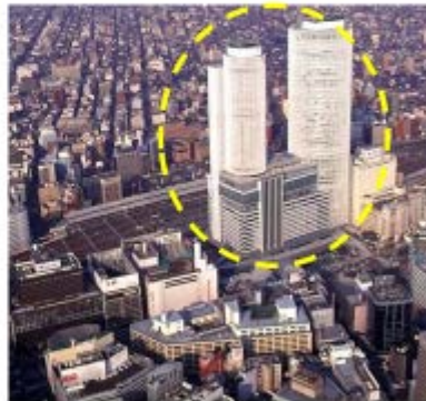
Opened in 2000