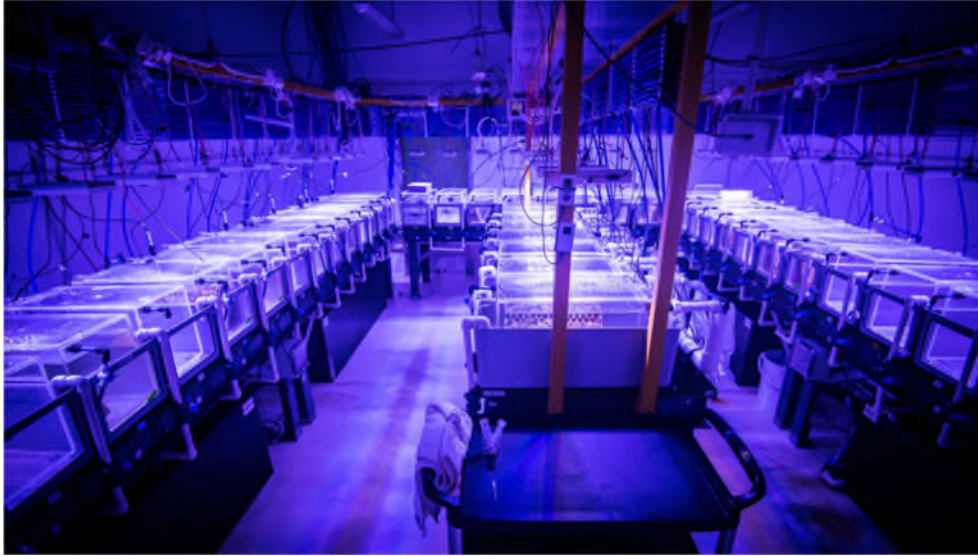
Figure 3 - Current Controlled Environment Room