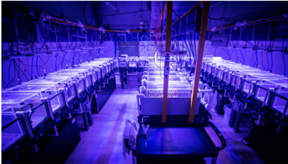
Figure 3 - Current Controlled Environment Room