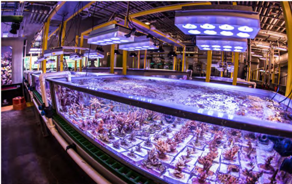
Figure 4 - Current Indoor Open Plan Aquaria Space

14.7 The indoor aquaria space open plan experimental areas will be expanded by approximately 40%. The indoor open plan spaces enable further manipulation of lighting and diurnal cycles for large experimental tank systems.