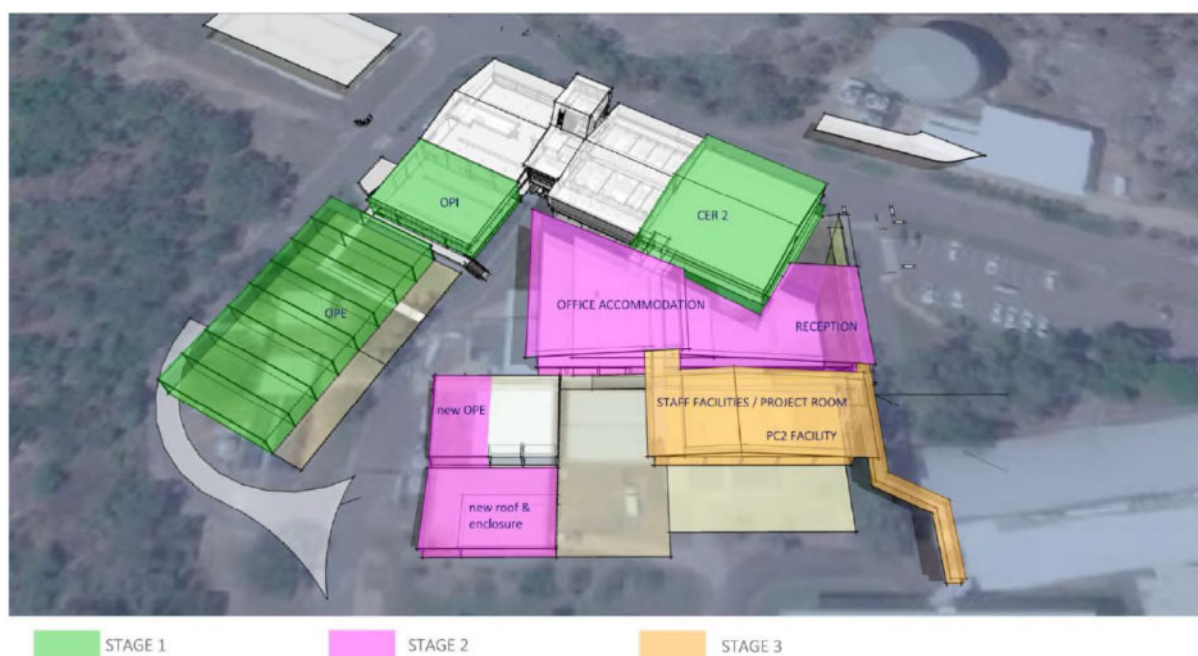
Figure 1: Concept master plan

10.1 AIMS has developed a masterplan for the future growth and expansion of SeaSim, which provides for potential future stages and expansion of the facility as demand and funding allow. The following diagram details the current scope as stage 1, with future expansions in stage 2 and 3 noted in purple and orange, respectively.