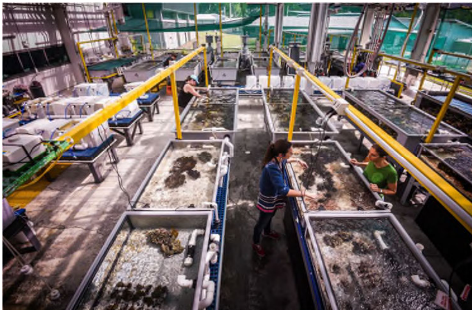
Figure 2 - Current Outdoor Aquaria Space

14.5 The outdoor open plan experimental areas will be expanded in capacity by over 200%. These large open spaces are covered with a transparent roof which enables the transmission of full spectrum sunlight. This additional covered space provides for multiple large experimental tank systems. These systems enable replication of current and projected future conditions on the Great Barrier Reef.