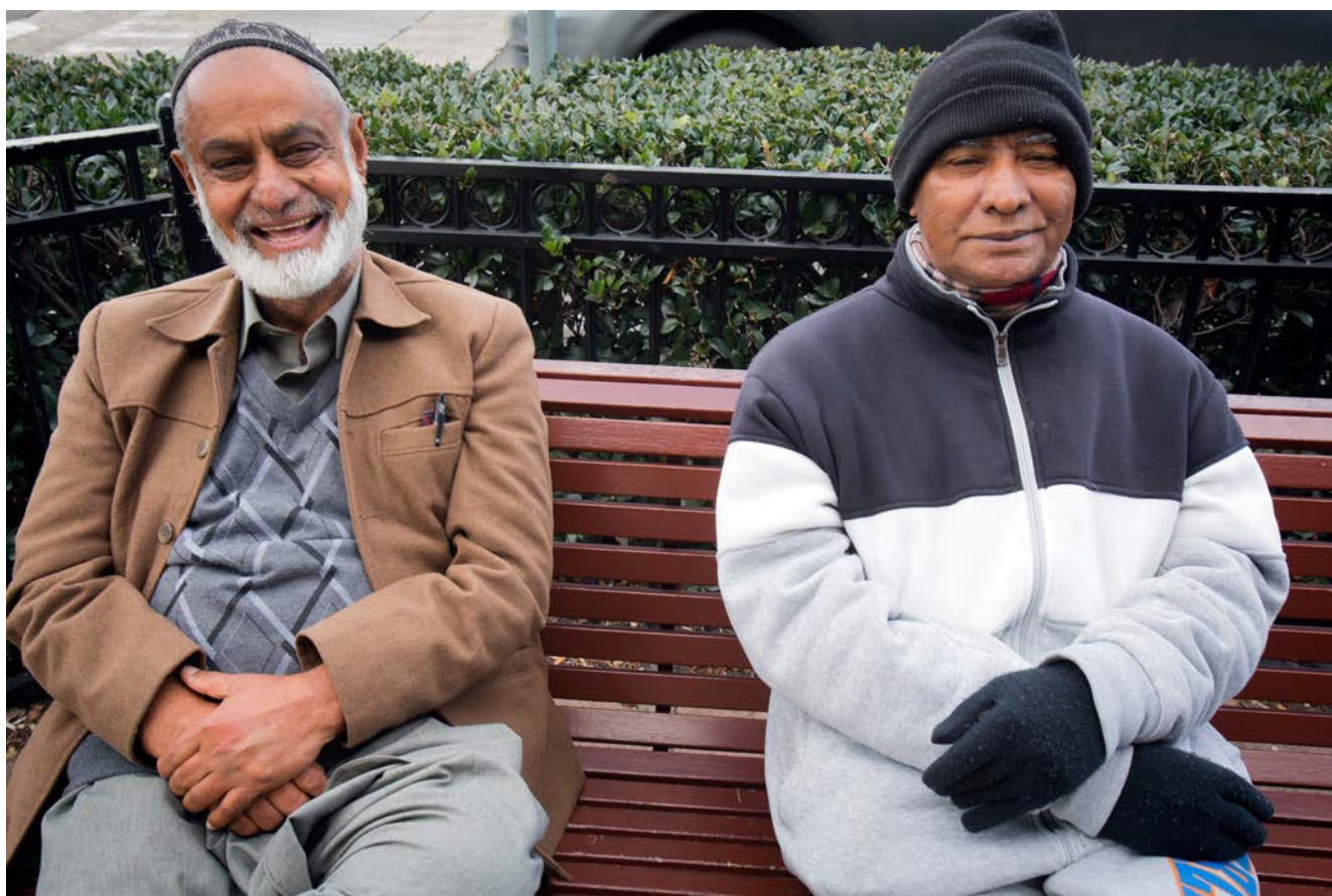
Local residents of Lakemba