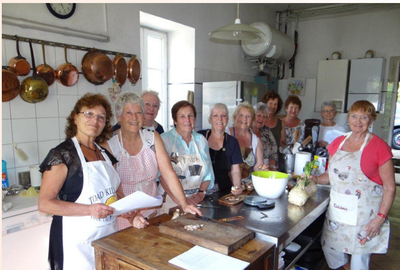
Sapphire Coast cooking class, U3A