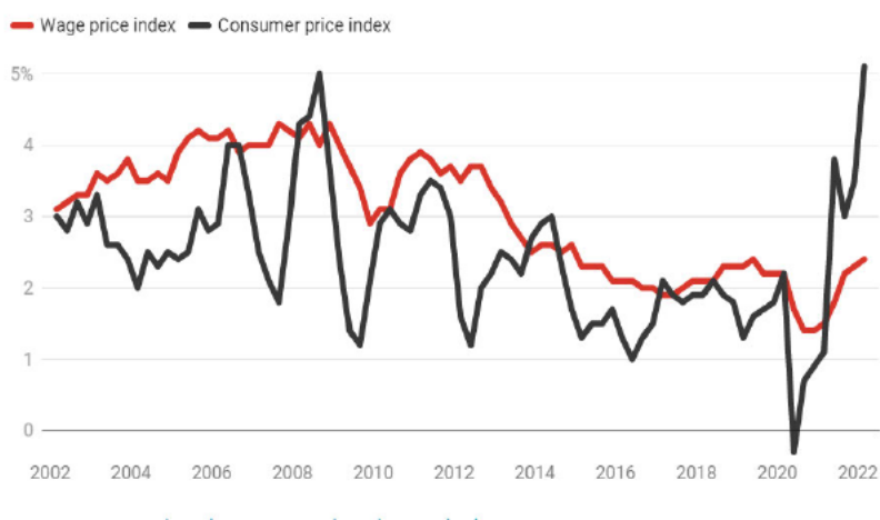
Figure 1: Annual indices of wage and consumer prices (inflation) between 2002 and 2022 indicate significant fluctuation in inflation than wage growth in the short term but follow similar trends in the longer term—source: ABS Wage Price Index, 7 Consumer Price Index. 8