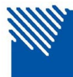
NEW SOUTH WALES IRRIGATORS' COUNCIL