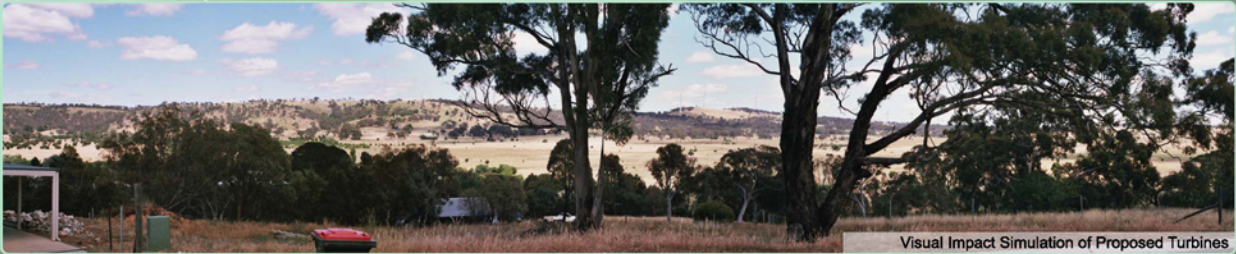
Visual Impact Simulation of Proposed Turbines