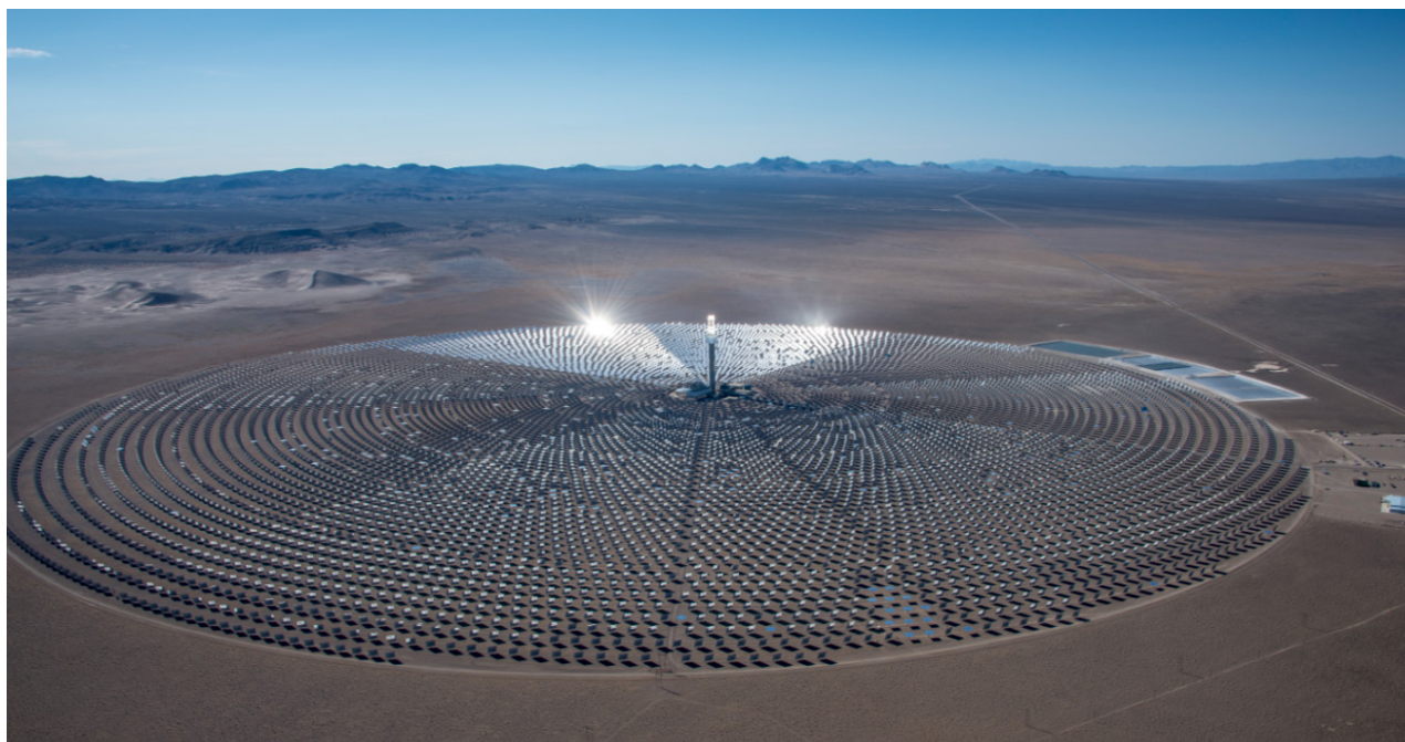
Crescent Dunes Solar Energy Project, Nevada, USA. 110MW with 10 hours of full load storage (1,100MWh)

SolarReserve has successfully financed and constructed more than US$1.8 billion of large scale solar projects worldwide. These include the 110 MW Crescent Dunes CSP project in Nevada, now in its commercial operations phase; the 75 MW DC Letsatsi and Lesedi Solar PV Projects; and the 96 MW DC Jasper Solar PV Project in South Africa, now fully operational. Construction is due to commence shortly on the 100MW Redstone CSP project in South Africa.