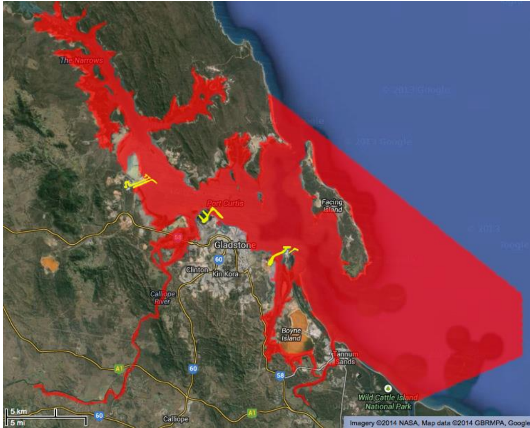
Attachment 3: Gladstone – Likely PPDA