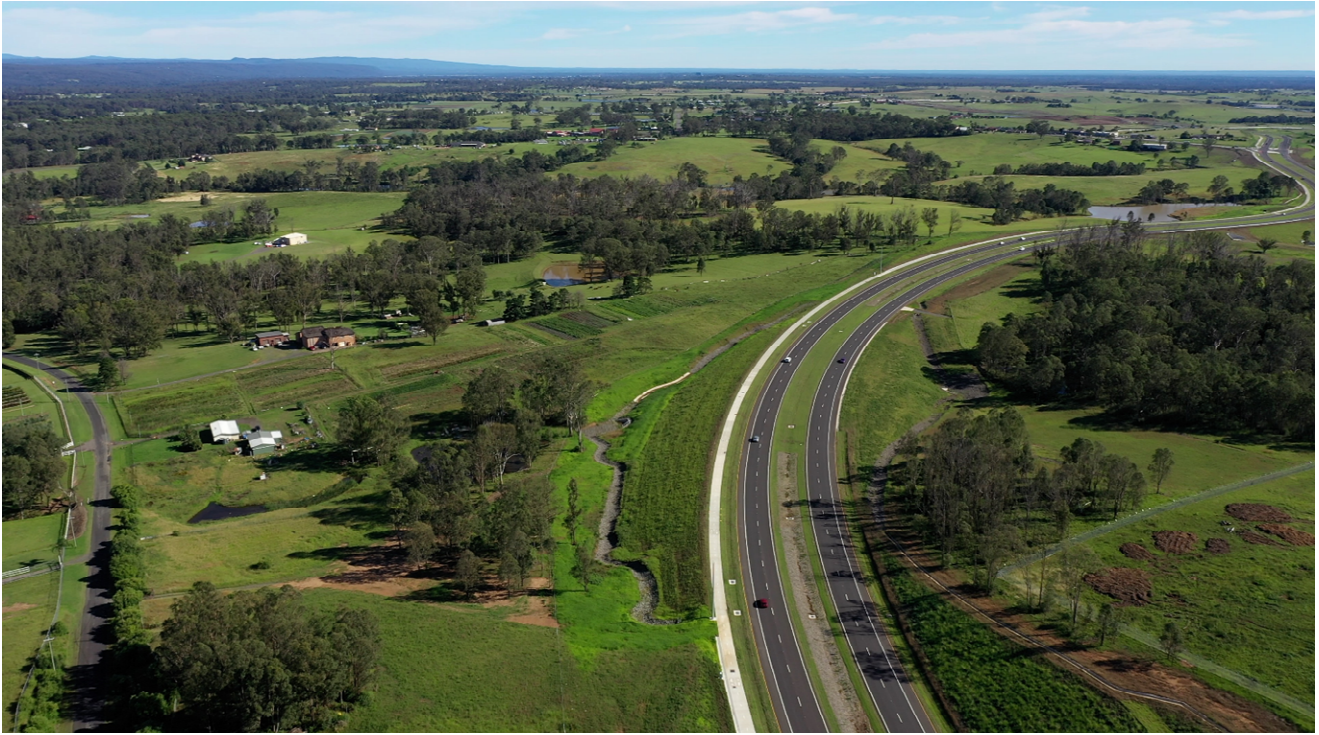
The Northern Road Luddenham shops access