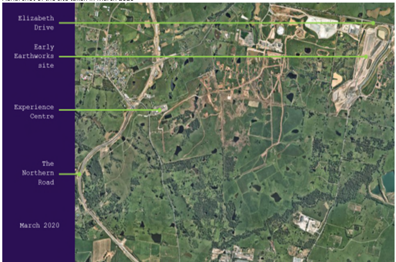
Aerial shot of the site taken in March 2020

The Airport encompasses nearly 1,800 hectares of undulating terrain. Preparation of the site involves around 25 million cubic metres of earthworks to level the site, the relocation of high-voltage powerlines, cemeteries and heritage sites. Works are well underway with powerlines undergrounded, cemeteries relocated and 11.9 million cubic metres of soil – almost the halfway-mark of earthworks on the site - moved to date. Aerial shots (below and over page) of the site taken in March 2020 and January 2021 show the progress of works on the site. A number of minor roads within the Badgerys Creek site were closed or realigned as part of these early works. The early realignment of Badgerys Creek Road minimises the impact on traffic flow around the site while the Airport is being constructed. A significant amount of high quality sandstone spoil from Sydney Metro tunnelling sites at Chatswood and Marrickville has been stockpiled on site for reuse as fill material. This has provided significant savings for both the Airport and Sydney Metro projects.