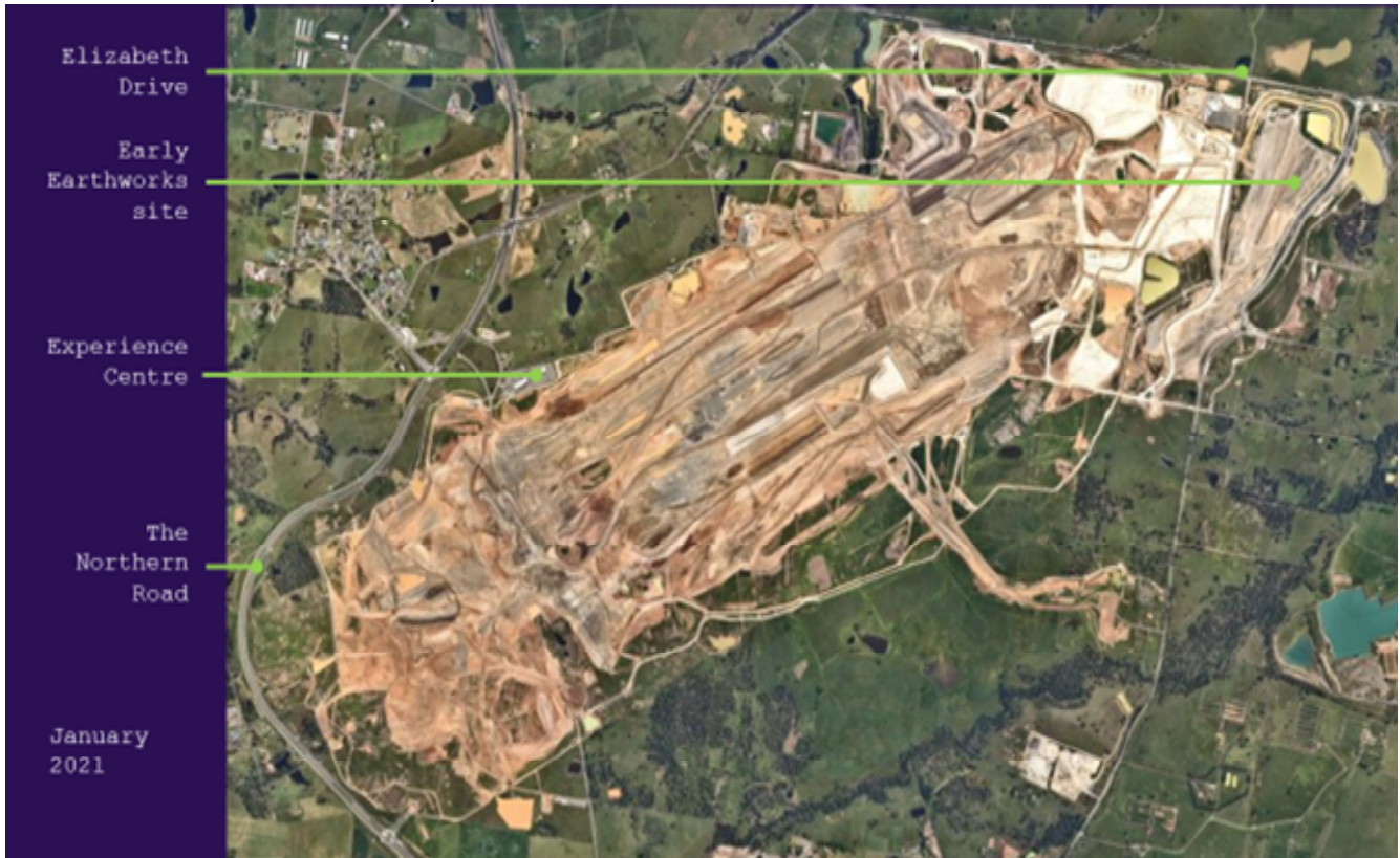
Aerial shot of the site taken in January 2021

As part of the WSIP, funding was provided for major upgrade and realignment of The Northern Road between the Old Northern Road, Narellan and Littlefields Road, Luddenham, and to construct the M12 Motorway. The M12 will be a new 16-kilometre motorway with two lanes in each direction, a central median allowing future expansion to six lanes, and connecting the Airport to the M7 Motorway and The Northern Road.