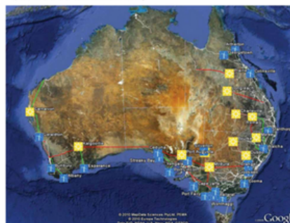
1. Beyond Zero Emissions November 2016