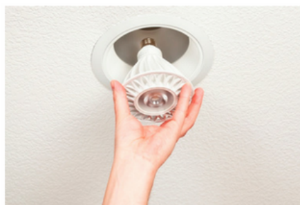
1. Beyond Zero Emissions November 2016

The full national upgrade - for commercial as well as residential buildings - can be completed within 10 years and save $40 billion over the next 30 years and in the residential sector alone the task of fixing Australia's buildings will create around fifty thousand jobs in the trades sector.