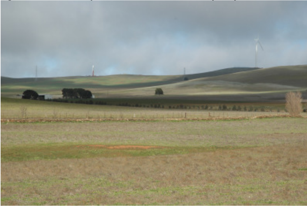
Snowtown area, turbines being installed.