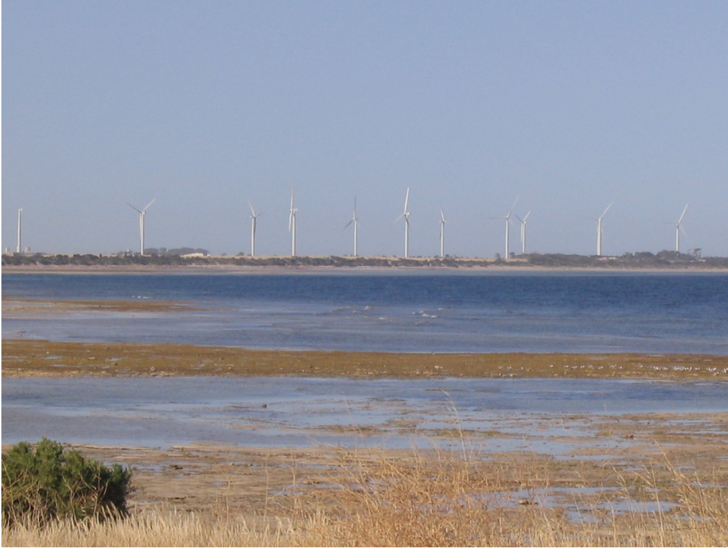
Wattle Point, Southern Yorke Peninsula, South Australia