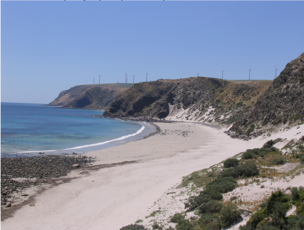
Starfish Hill wind farm, near Cape Jervis, South Australia