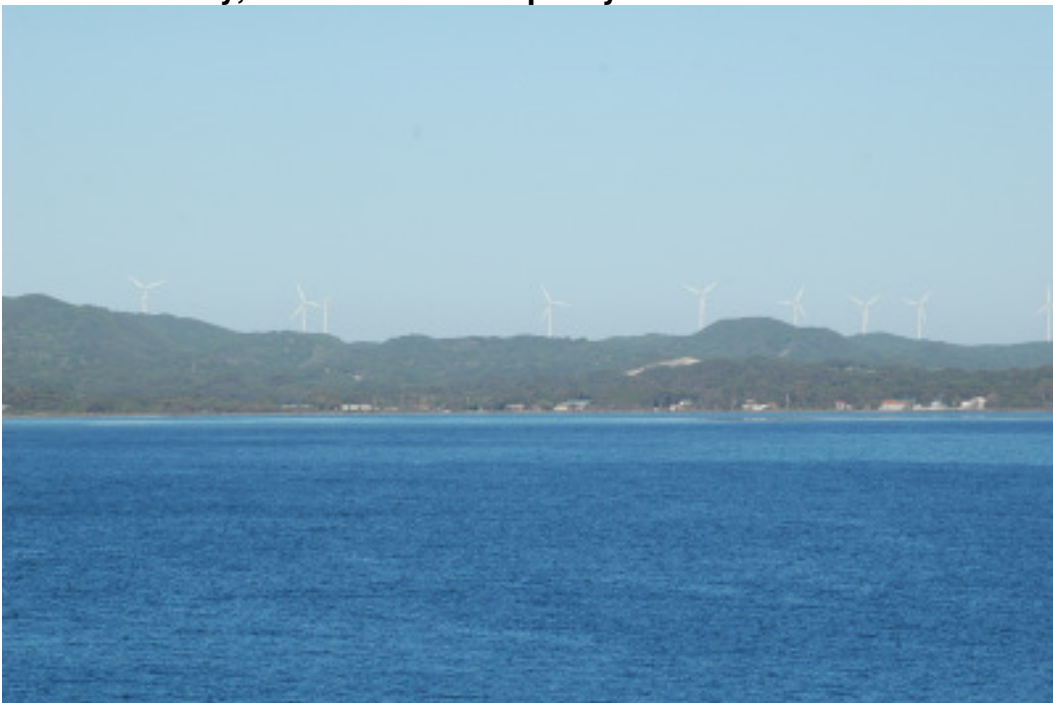
Wind farm near Albany, Western Australia