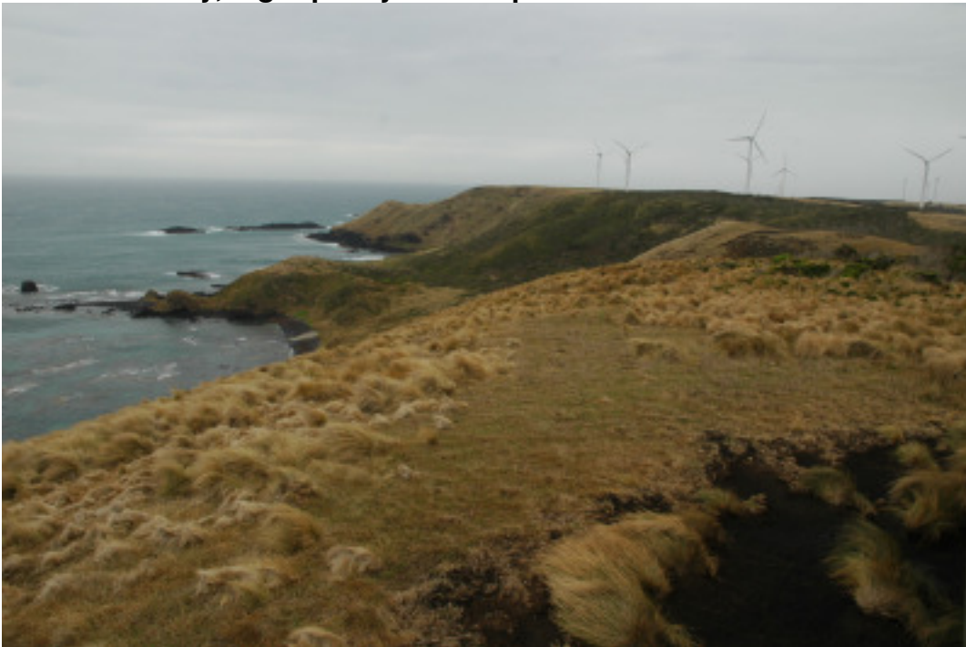
Woolnorth wind farm, north west Tasmania