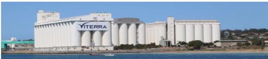
Auctioning shipping slots from South Australian ports is creating competition in storage and handling for producers. A prime location and time - such as Port Lincoln (pictured) in February - would command a premium from exporters.