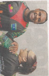
WAM HITS BACK: IWC were forced to pay $2200 and remove the Aboriginal flag from all future shirts.

"The Aboriginal flag has had licensing agreements attached to it since 1998 which have been enforced since that time. We are merely a licensee meeting our obligations under our agreements and we offer our assistance to other organisations wishing to use the flag under our licence."