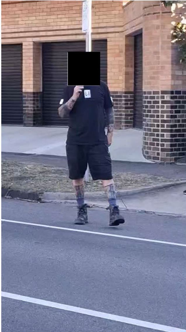
National Workers Alliance