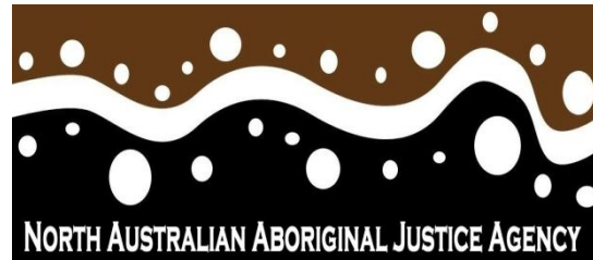
NORTH AUSTRALIAN ABORIGINAL JUSTICE AGENCY