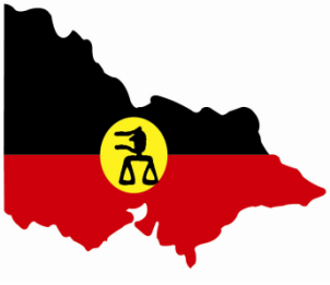
Victorian Aboriginal Legal Service Co-operative Ltd