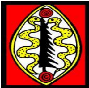
Aboriginal Legal Rights Movement Inc