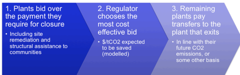
Figure 2: A market mechanism for coal fired power plant closure – simplified representation

A market mechanism with industry funding would also provide a direct source of funding for structural adjustment packages, and for high-level site rehabilitation.