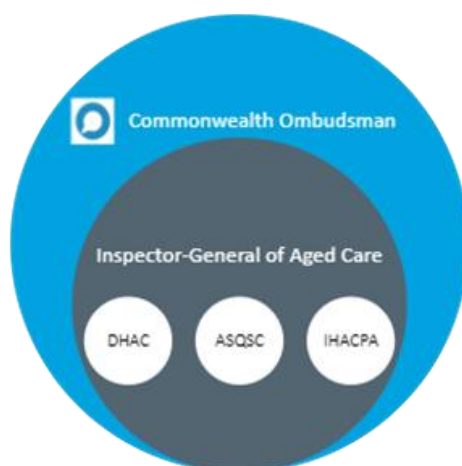
Figure 1: Hierarchy of oversight