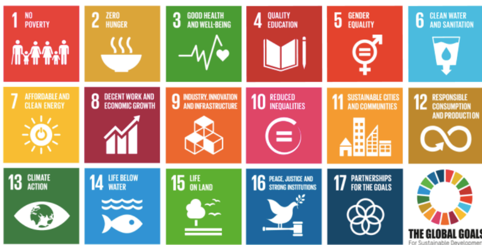
Figure 1: Sustainable Development Goals

2