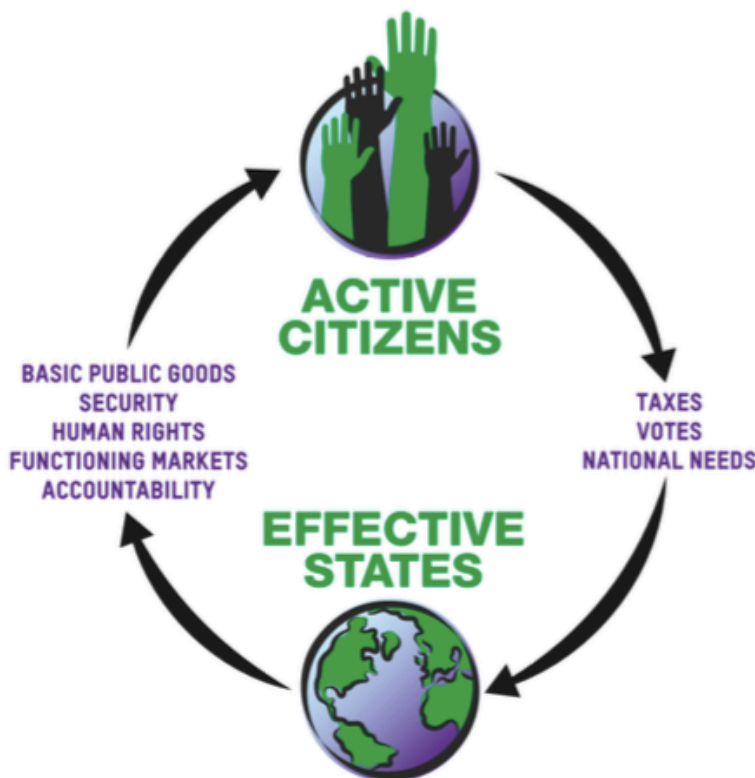
Figure 2: The citizen-state compact

Australian aid should enable countries to be owners of the development process and support the citizen-state compact by actively supporting participation, inclusive decision-making and social accountability.