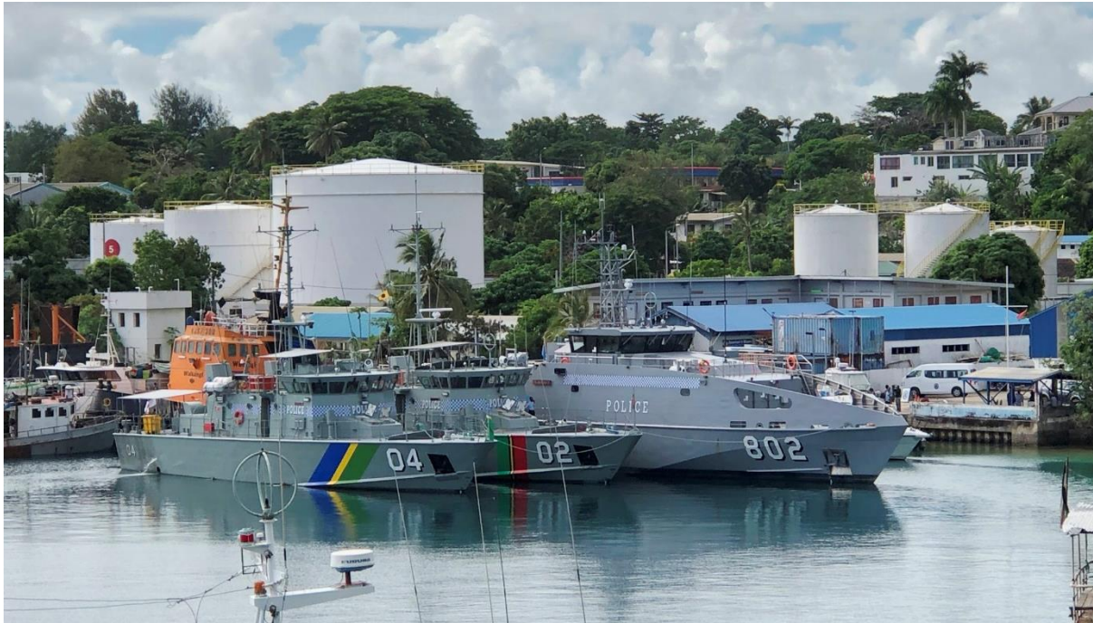
Figure 5 – Guardian class Patrol Boat HMTSS Te Mataili (802) alongside Pacific class Patrol Boats RVS Tukoro (02) and RSIPV Auki (04), Australian High Commission Vanuatu, 2019

While the four foundational naval construction programs form the base for creating a sovereign national enterprise, naval shipbuilding extends much further than the production of naval ships and submarines. It covers all elements of the capability lifecycle – from initial concept design, production planning, construction, test and evaluation, in-service support and upgrades through to decommissioning and disposal – as a coordinated system of interconnected dependencies.