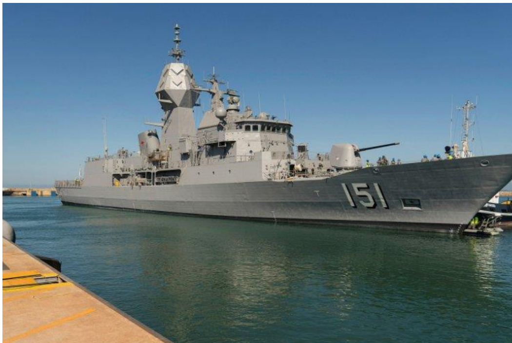
Figure 3 – HMAS Arunta post- upgrade, Department of Defence, 2019

The adoption of an enterprise approach to naval shipbuilding and sustainment aims to set a more stable and predictable demand profile for naval construction and maintenance. Making this commitment provides certainty to Australian industry through the retention and further development of specialist skills, and drives further investment and efficiencies amongst local Australia suppliers. Current upgrades to the Anzac class frigates demonstrate this concept in practice. The Anzac Midlife Capability Assurance Program is leveraging the experience gained by the Warship Asset Management Agreement industry alliance during the earlier Anzac Anti-Ship Missile Defence program. The first ship in this program, HMAS Arunta , is now at sea with CEA Technologies' CEAFAR2-L long-range air search radar and integrated Identification Friend or Foe capability operating in a new mast superstructure. The experience gained by Australian industry in this project will be further leveraged for the integrated mast for the Hunter class frigates.