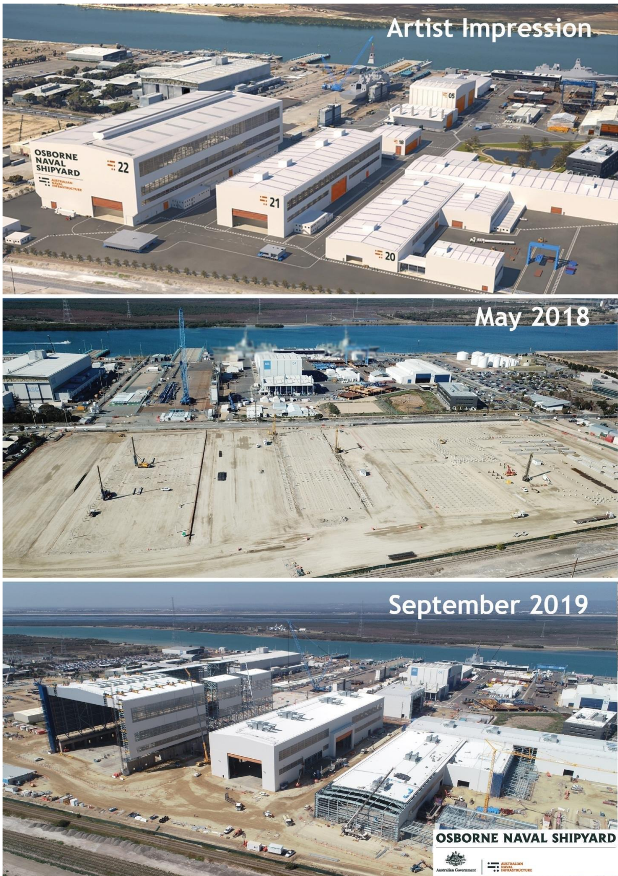
Figure 4 – Osborne Naval Shipyard (South), Australian Naval Infrastructure, 2019