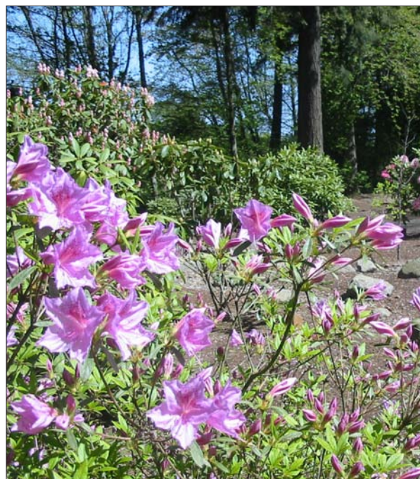
Treating ornamental shrubs by soil drenches results in long-lasting residues in nectar and pollen. Imidacloprid was found in rhododendron blossoms more than three years after treatment.

Studies of residues in ornamental plants are limited to a few plant species and only one product, imidacloprid. Acetamiprid, clothianidin, dinotefuran, and thiamethoxam are active ingredients in products registered for use in ornamental landscapes, but little is known about residue levels of those compounds in pollen and nectar or ornamental plants. Application during flowering is allowed for products under homeowner registration. This increases risks to pollinators, since it seems that residues occur in higher levels in pollen and nectar when these insecticides are applied during bloom (e.g. Dively and Hooks 2010).