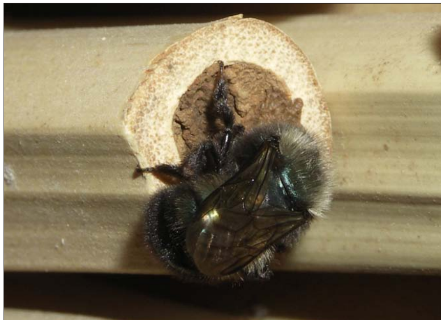
Studies demonstrate that larvae of blue orchard bees take longer to develop in the nest when their food supplies are tainted by neonicotinoid residues.

Finally, using cavity-nesting bees like the blue orchard bee in field tests might be more informative than toxicological studies examining honey bees given the more limited foraging range of most solitary species. As the acreage of neonicotinoid-treated crops increases there are proportionately fewer areas of untreated plants available to bees seeking food. Smaller native bees that have restricted flight ranges may increasingly be confined to treated areas.