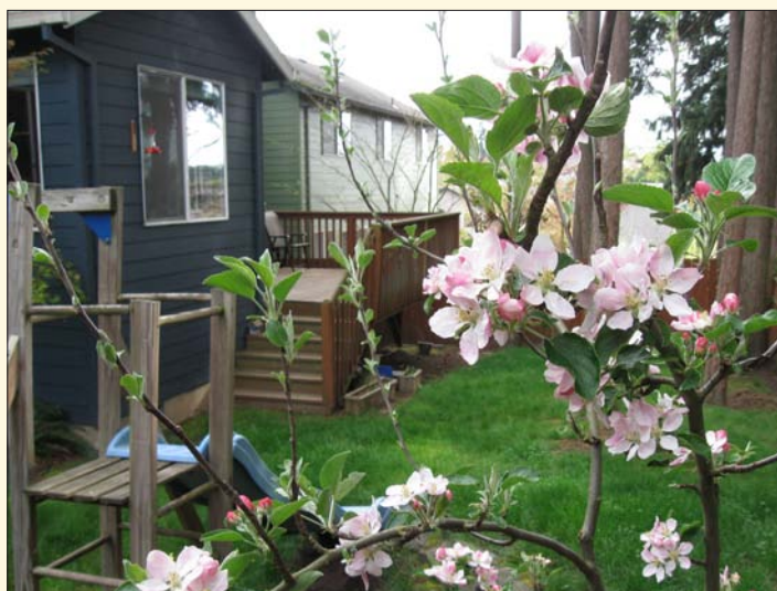
The amount of imidacloprid that is allowed to be applied to apple trees in backyards is many times higher than is allowed in commercial orchards.

This would make the relative backyard application rate 60 times greater for a 30" circumference tree (9.5" diameter), and 120 times greater for a tree of 60" circumference (19" diameter).