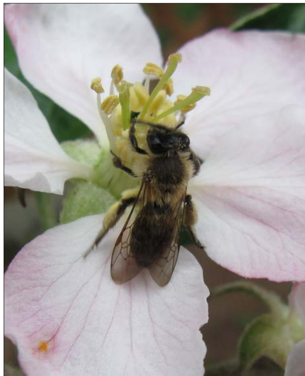
Solitary bees, such as this mining bee foraging on apple blossom, despite forming the majority of bee species have generally been overlooked in neonicotinoid risk assessments.

Field studies, where bees are able to move between the treated crop and nearby areas, should demonstrate that