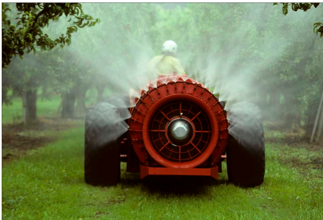
Systemic insecticides may be regularly applied in a preemptive attempt to reduce insect damage to crops, and not as a response to pest insects being on the plants.

Routine (calendar-based) spraying and preemptive treatments are contrary to the philosophy of IPM. With only a few exceptions, the increasing prophylactic use of systemic insecticides such as neonicotinoids (Sur and Stork 2003) represents a shift in pest management towards applying chemicals before pest damage has occurred. This approach negates the principles of IPM because insecticides are used before their need is demonstrated, and it complicates the ability to use biological control agents.