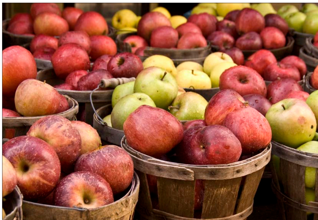
Pollinators—mostly bees—are needed for more than two-thirds of the world's crop species. Bee pollinated crops are worth around $20 billion each year in the United States.

The European honey bee ( Apis mellifera ) is the most widely managed crop pollinator in the United States. Studies indicate honey bees are important for more than $15 billion in crop production annually (Morse and Calderone 2000). However, the number of honey bee colonies has been in decline because of disease, parasites, and other factors (National Research Council 2007). Native bees are also important crop pollinators. They provide free pollination services, and are often more efficient on an individual bee basis at pollinating particular crops, such as squash, berries, and tree fruits (e.g., Tepedino 1981; Bosch and Kemp 2001; Javorek et al. 2002). Native bees are important in the production of an estimated $3 billion worth of crops annually to the United States economy (Loosey and Vaughan 2006). Beyond agriculture, pollinators are keystone species in most terrestrial ecosystems: they pollinate the seeds and fruits that feed everything from songbirds to grizzly bears. Thus, conservation of pollinating insects is critically important to preserving both wider biodiversity and agriculture.