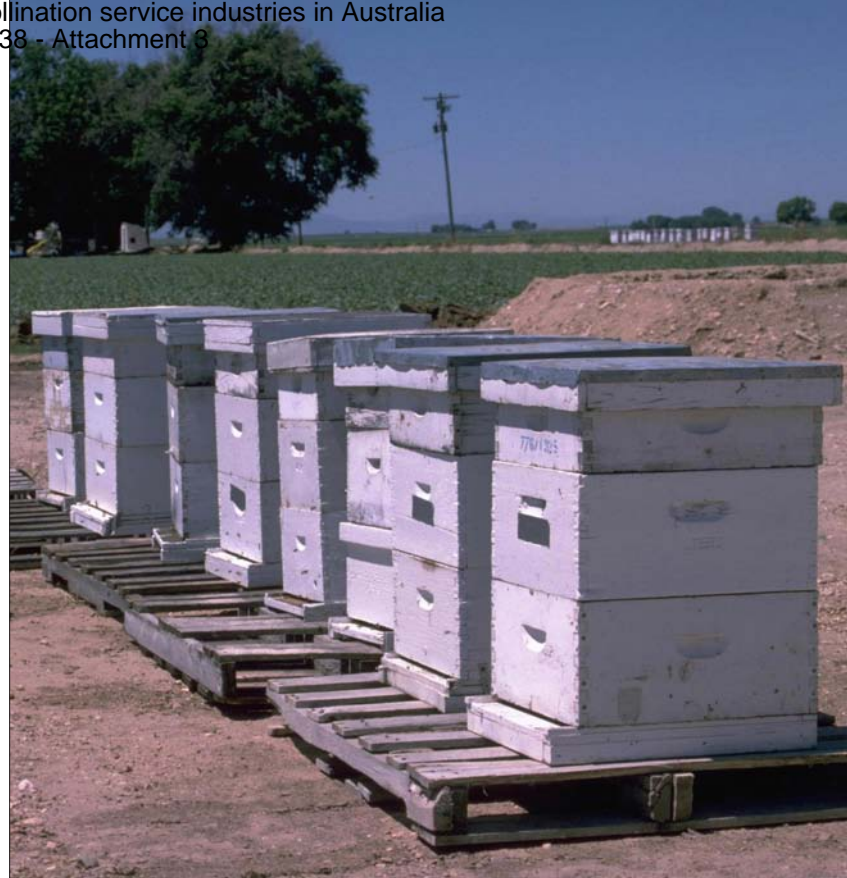
Commercial beekeepers have lost tens of thousands of hives in the last few years due to colony collapse disorder. There is no evidence that neonicotinoids are a direct cause of this, though they interact with other factors such as Nosema parasites.